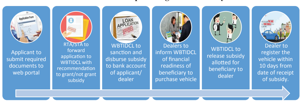
Chart 4.1: The process/grant of subsidy

Audit sampled 15<sup>172</sup> out of the 23 districts of the State, covering 65 per cent (15,565 applications) of the total sanctions amounting to ₹ 138.89 crore made by the Department under this scheme. Further, in case of 6,875 sanctions, Audit also cross checked the vehicle registration data with those available in the Transport Department for seven<sup>173</sup> districts of the State.