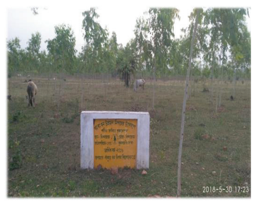
Animals grazing at plantation site

Audit inspection showed that records on expenses incurred for replanting the area (site-wise) were not maintained