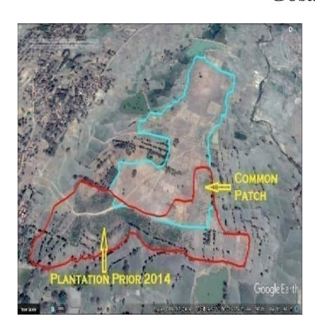
COMMON PATCH Google Earth