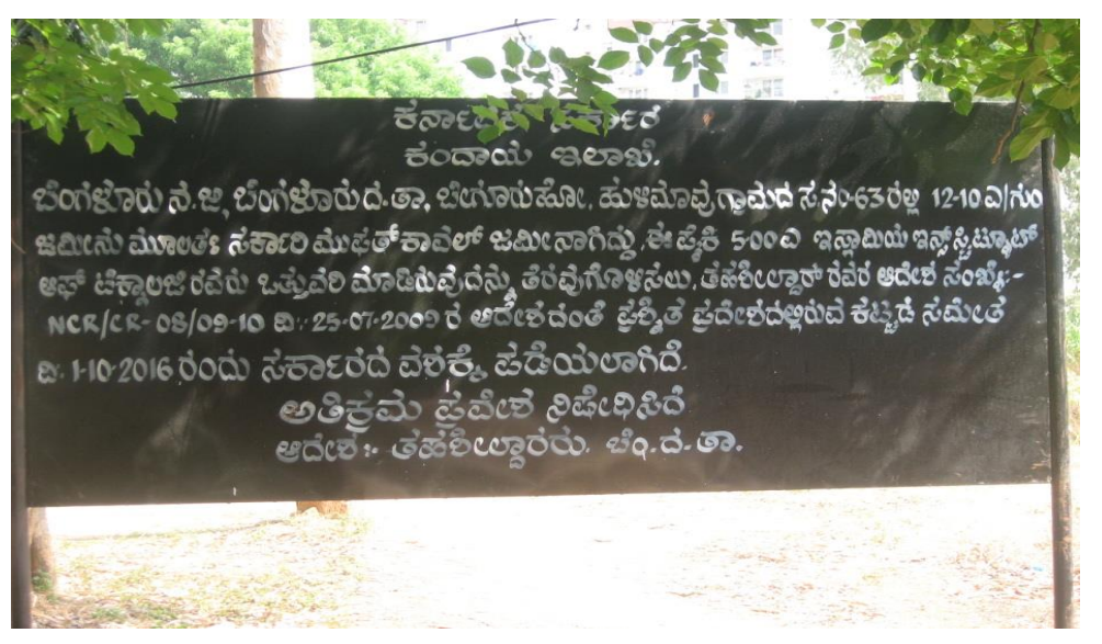
12-10 A-G of land in Survey Number 63 of Hulimavu village, Begur Hobli, Bangalore South Taluk, Bangalore Urban district is basically a Mufthkaval (grazing) land. An extent of 5-0 A-G out of this encroached by Islamia Institute of Technology, was to be evicted as per order No.NCR/CR-08/09-10 dated 27 July 2009 of the Tahsildar. As per the board displayed above, it has to be taken possession of along with the building on 1 October 2016.

Illustration of a case which continued under encroachment is picturised below: