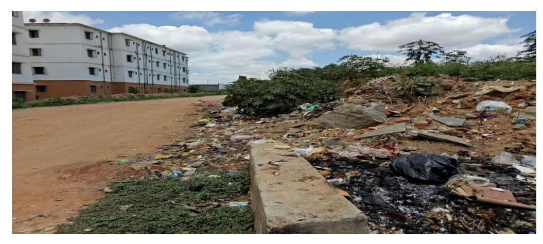
5 Acres (Sy.No.115, Channasandra village, Bengaluru East Taluk) was leased to Rajarajeshwari Education Trust for educational purposes which was not put to use even after 13 years ( 2^{nd} June 2017).