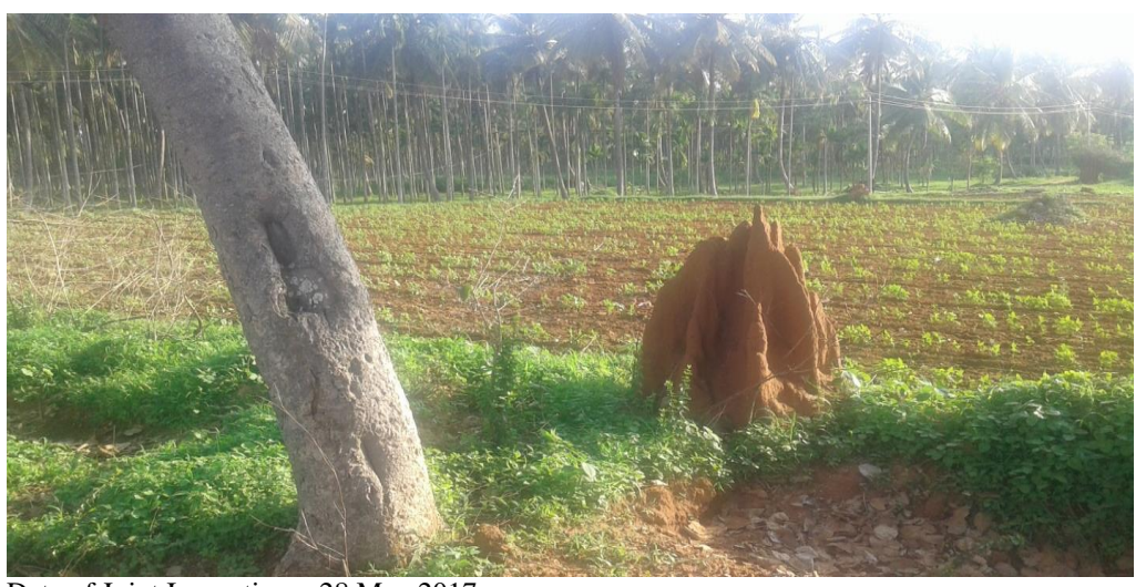
Date of Joint Inspection – 28 May 2017

An illustration showing re-encroachment of evicted land is given below: