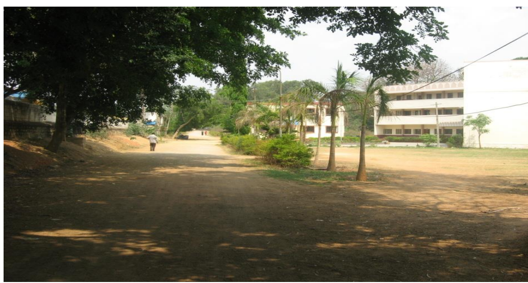
Date of Joint Inspection – 20 April 2017

5 Acres (Sy.No.63, Hulimavu village, Bengaluru South) encroached by Islamia Institute of Technology was found not evicted during joint inspection with the Department though an eviction board as shown above had been put up at the spot.