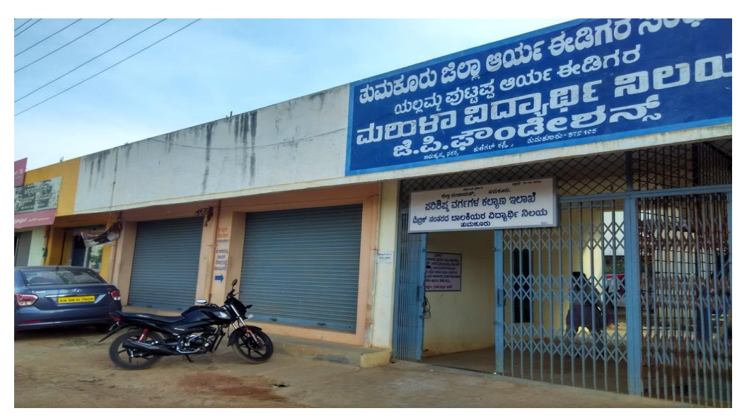
2 acres (Maralur village, Tumakuru Taluk) was granted to Arya Ediga Sangha for construction of school hostel, which was diverted for commercial purposes (1st March 2017).