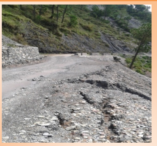
Unpaved and without revetment of Rumehar-Lam road in Kangra district, Himachal Pradesh