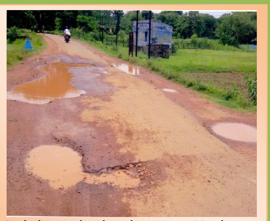
Potholes developed on Marthapur-Jamunakote road due to non-maintenance of road Dhenkanal district, Odisha