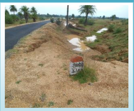
Road Raidih to Rajsar was completed without providing connectivity to Rajsar which was about 8 km. away from the end point of this road in Deoghar district, Jharkhand