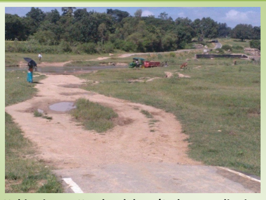
Habitation Kumhardab (Jashpur district, Chhattisgarh), was not provided connectivity due to non-construction of long span bridge