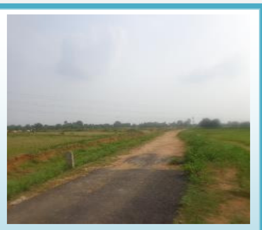
Unconstructed portion of road (more than 500m) left the habitation as unconnected (in L046 to Jala, Block Garhwa Hazaribag district, Jharkhand)