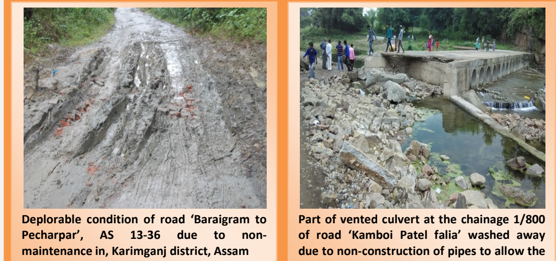
water to cross safely in Dahod district, Gujarat

Joint physical verification of roads constructed and completed under the programme showed that roads were not maintained properly and in deplorable conditions. Photographs taken during this exercise corroborates the poor status of the roads are given below: