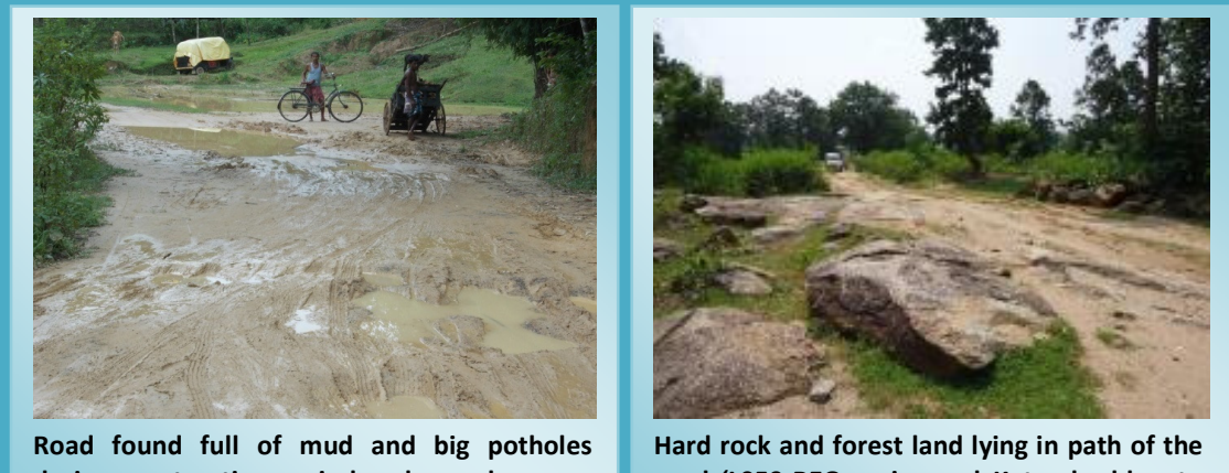
Road found full of mud and big potholes during construction period under package no. AS 13-59 in district Silchar, Assam

In eight states (Arunachal Pradesh, Assam, Chhattisgarh, Jammu & Kashmir, Jharkhand, Manipur, Sikkim and Uttarakhand), road works were either not completed or roads were in deplorable condition due to poor quality of bituminous works, potholes, bridge works left incomplete, non-completion of the Bailey bridge<sup>1</sup>, defective cutting of hill side under Stage-I work. Further, defective road works were executed as shown in the photographs below and state-wise details are given in Annex-7.3.