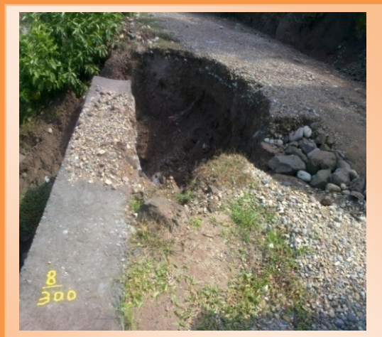
Non- construction of adequate number of cross drainage and poor construction in road Galak to Upper Rajwalta in Kathua district, Jammu and Kashmir