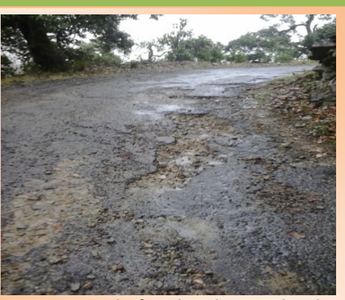
Bituminous work of road Mailsain to Chopda was found damaged at various places in Pauri district, Uttarakhand