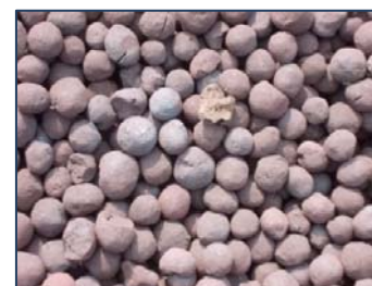
Figure 1.3 Iron Ore pellet

Various varieties of Iron ore, except Pellets/ Sinters, are traded and loaded in wagons from mine areas/ loading points.