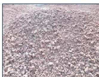
Figure 1.2 Iron Ore lump

which means re-forming them into lumps of suitable size by a process called sintering/ pelletisation.