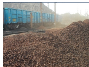
Figure 1.1 Iron Ore Fines

Iron ore is the basic raw material used for making pig iron, sponge iron and finished steel. Mined iron ore contains lumps of varying sizes 6 . The blast furnace used for processing 'Iron ore' at manufacturing units requires lumps between 7 to 25 mm. As such, bigger lump ore is required to be crushed. Crushed ore is divided into various groups by passing it over sieves and lumps (7 to 25 mm in size) are separated from the fines (less than 7 mm). If the lump is of appropriate quality, it can be charged to the blast furnace without any further processing. Iron ore fines, which cannot be put directly in blast furnace, however, must be agglomerated,