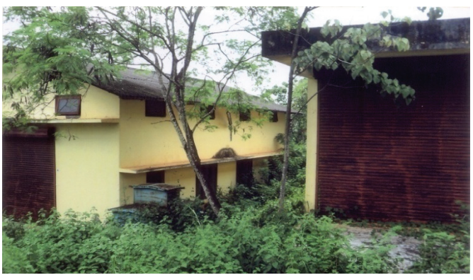
Building of Apparel Park in dilapidated condition

sewing machine. ironing system, etc., and 7.5 KVA Generator at a cost of ₹15.78 lakh and installed them in the newly constructed building of industrial women estate. Construction of office building, work sheds and water tank was also completed at a cost of