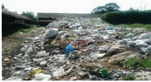
Waste heap at proposed SWM Plant site

Changanacherry Municipality made a provision of ₹6.53 lakh in the DPR for 1000 removal of about tons of accumulated waste (as of 2007) at the yard processing to facilitate the establishment of the treatment plant. The Municipality entrusted the work of the