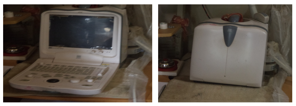
Portable Ultrasound machine used at a clinic at Manjuri Road, Bhadrak

Audit further noticed that the clinic used the same since October 2008 as the unique serial number of this portable machine was also mentioned in the registration certificate issued (January 2009) by the DAA. The same unique serial number was also mentioned in the application for registration by the owner as well as in the Inspection Report of CDMO (October 2008) without any indication that it was portable.