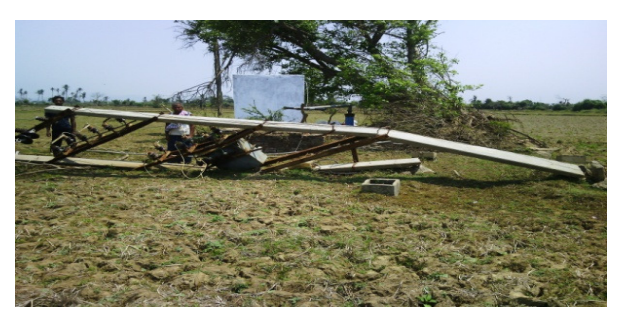
LIP at Agasti Nuagaon-1 village under Chhatrapur Block not restored

• As per the instructions issued (November 2013) by Managing Director, Odisha Lift Irrigation Corporation, all repair works should be completed by December 2013 so as to enable Lift Irrigation Projects (LIPs) to run in Rabi 2013-14.