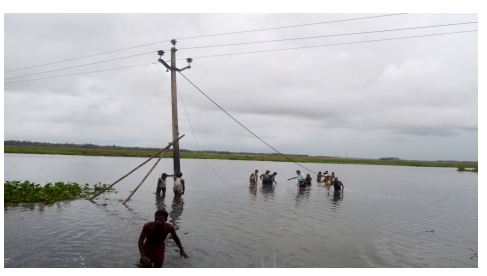
People in Puri working in water logged area to restore power supply

Energy infrastructure was worst affected among all public properties. There was damage to 33/11 KV Lines, Distribution Transformers and Low level transmission networks ultimately resulting in non-supply of power to