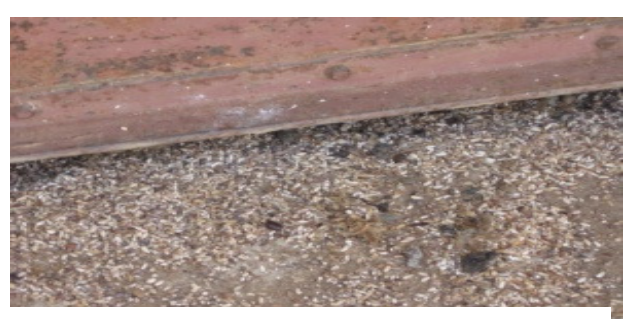
Damaged rice stored in one GP of Dhamnagar block

Paragraph 177 of ORC assigned the responsibility to Collector for ensuring distribution of standard quality of food for relief and to store it at damp-proof and