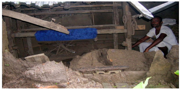
Damaged loom of a Weaver Cooperative Society Baliapal

assistance to artisans repair for and replacement of equipment and raw material is to be given at a rate of ₹ 3000 for equipment and the same for raw material and finished products.