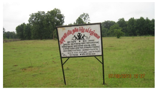
The field showing non-survival of mango grafts under NHM

Test check of records of the Horticulturist, Baripada revealed that 5520 mango grafts were provided (2009-13) to 50 ST farmers for plantation in their own land for which ₹ 6.28 lakh was utilised. Out of the grafts provided, 3985 (72 per cent) plants died within the maintenance period due to lack of water.