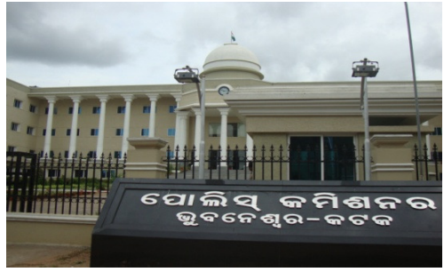
Police Commissionerate office at Bhubaneswar constructed without approval of building plan

The Department stated (February 2013) that the Planning Wing was sending copies of approval/ refusal of building permission to the Enforcement Wing since May 2012 and steps were being taken by the field staff to detect/ check unauthorised constructions.