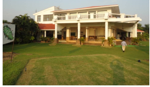
Bhubaneswar Golf Club

noticed that though nine applications (May-August 2009) for allotment of 19.230 acre land were received with recommendation of DLSWCA for allotment of five acre land to set up IT industries, these units were denied (November 2009) allotment of land on the plea of non-availability of