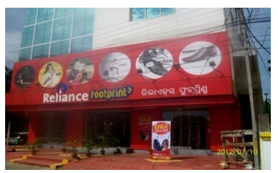
HIG-1 in 01-02 HIG Housing scheme at Jayadev Vihar being used for commercial purpose

Audit also noticed that in eight cases<sup>55</sup>, the basement/stilt floors approved for parking purpose were being used for residential as well as commercial uses such as showrooms. Due to lack of periodic inspections, such instances of misuse remained undetected. The PBSR of both the DAs provide for demolition/removal of area specified for parking of vehicles in case of misuse.