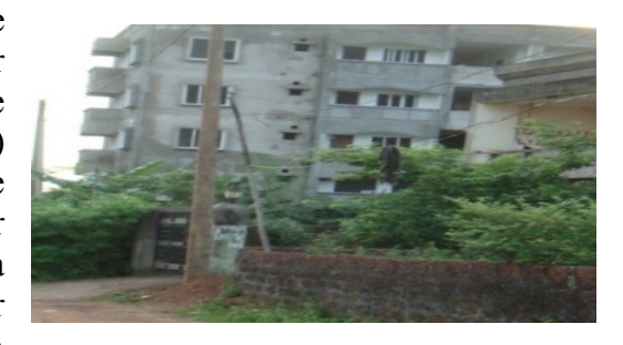
Approval of plan to builder on BDA's own plot

Audit noticed that for approval of the lay out plan by Bhubaneswar Development Authority, individual<sup>48</sup> executed (November 1984) a registered gift deed for 0.930 acre in favour of Bhubaneswar Development Authority in Patrapada However, Bhubaneswar Mouza. Development Authority did not take any steps for change of the RoR based on the said gifted land. Subsequently,