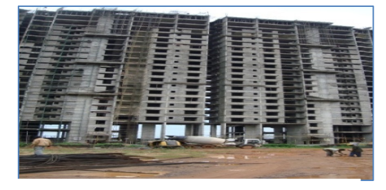
Building of HRG Finance and Investment Consultant (P) limited

Audit, however, noticed that in six cases, Bhubaneswar Development Authority and Cuttack Development Authority approved (2002-2012) building plans even though: