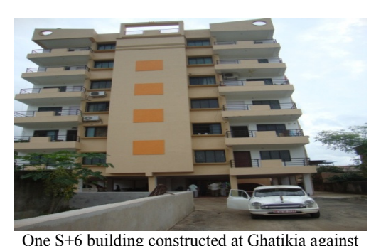
the approved plan of S + 4 building

Joint Inspection revealed that in 14 cases (BDA 8, CDA 6), constructions were completed deviating from the approved plan. Two multi-storeyed buildings were found to be constructed adjacent to National Highway, though the same was prohibited under Regulation 58(4C) of Bhubaneswar Development Authority. There were 15 buildings in Bhubaneswar Development Authority area including three of Government which were constructed without approved building plans. Thus, the existing enforcement mechanism provided no effective deterrence against unauthorised/ deviated constructions.