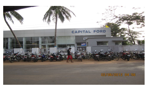
Plot allotted to Blackberry Infrastructure being used as Ford Show room

Tata Steel Limited: 4 years up to September 2009 as per lease deed to Brahmani River Pellets Limited (BRPL): three years up to July 2007 as per lease deed, Uttam Galva Steels Limited (UGSL): 370 acre: two years up to July 2008 mentioned in allotment order.