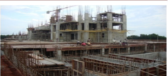
Construction of Vipul Greens at Raisingpur without clearance from MoEF

The Government stated (February 2013) that unauthorised proceeding (UAP) cases were initiated against those builders who had commenced