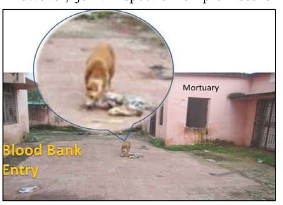
A stray dog devouring organic wastes thrown within Blood bank premises of SCB M&H, Cuttack

However, joint inspection of premises of SCBMCH Blood Bank, Cuttack