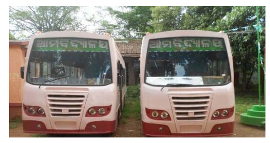
Buses kent idle in DPC, SSA, Koranut

Another EA (the DPC, SSA, Koraput) incurred expenditure of ₹ 27.18 lakh on purchase of two buses including accessories like computer, LCD TV<sup>35</sup>, generator set etc during January- May 2012 to use them as Mobile Education Buses in the district to provide education to the drop out students