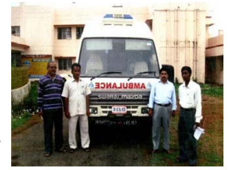
Ambulance meant for TCC Khordha is not deployed in strategic location

with adequate manpower and communication system. The hospital authorities were to these ambulances at strategic locations in consultation with the transport / police authorities to facilitate prompt arrival at the accident site, within the shortest possible time, for resuscitation and shifting accident victims/patients emergency care centres within first hour of accident, called the golden hour. intention was that if emergency care would be provided during this first hour of accident, the possibility of survival would be more.