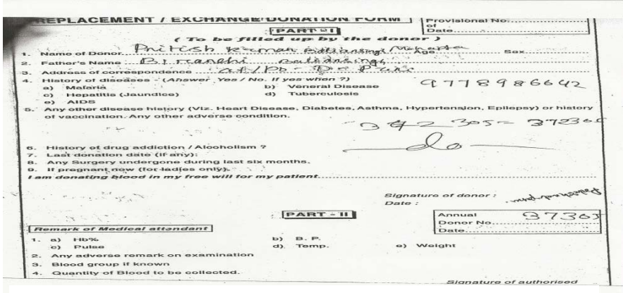
Specimen of a blood donor record of CRCBB, Cuttack where vital data (age, weight, Hb percentage etc.) of donor was not recorded

Blood Bank Officers attributed this to the high collection, shortage of manpower, overcrowding of patient's relations and clerical errors of staff. The reply was not convincing as failure to record such vital details was fraught with the risk of collection of inferior quality and unsafe blood.