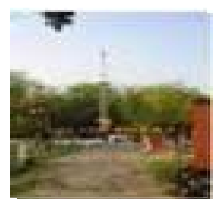
Gate ACD MLCG

All the ACDs interact with each other and exchange information when they are within their radio zones up to three kilometers. While approaching a station, loco ACD gives station approach warning to the driver. In the event of not acknowledging this warning, the speed of the train is regulated automatically. While entering the station area, if loco ACD detects a train on the main line the system automatically regulates the speed. In the mid section, loco ACDs remain in look out position to detect the presence of other trains in a radius of three kilometers. In case, another train is approaching on the same track, the ACDs apply brakes in both the trains to bring them to a stop thereby reducing possibility of head-on collisions. When a train is approaching a level crossing gate, visual and audio warning is initiated by the ACD systems for the road users.