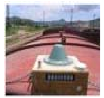
Goods Guard ACD