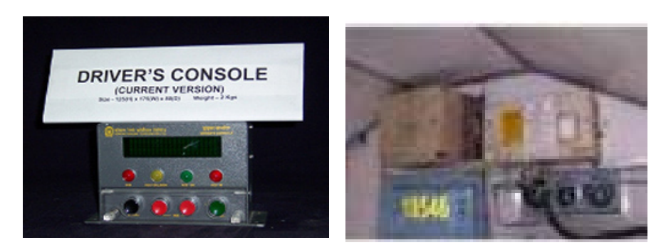
LOCO ACD ABU

There are two types of ACD equipments viz. mobile ACDs for locomotives and brake vans and stationary ACDs for stations and level crossing gates.