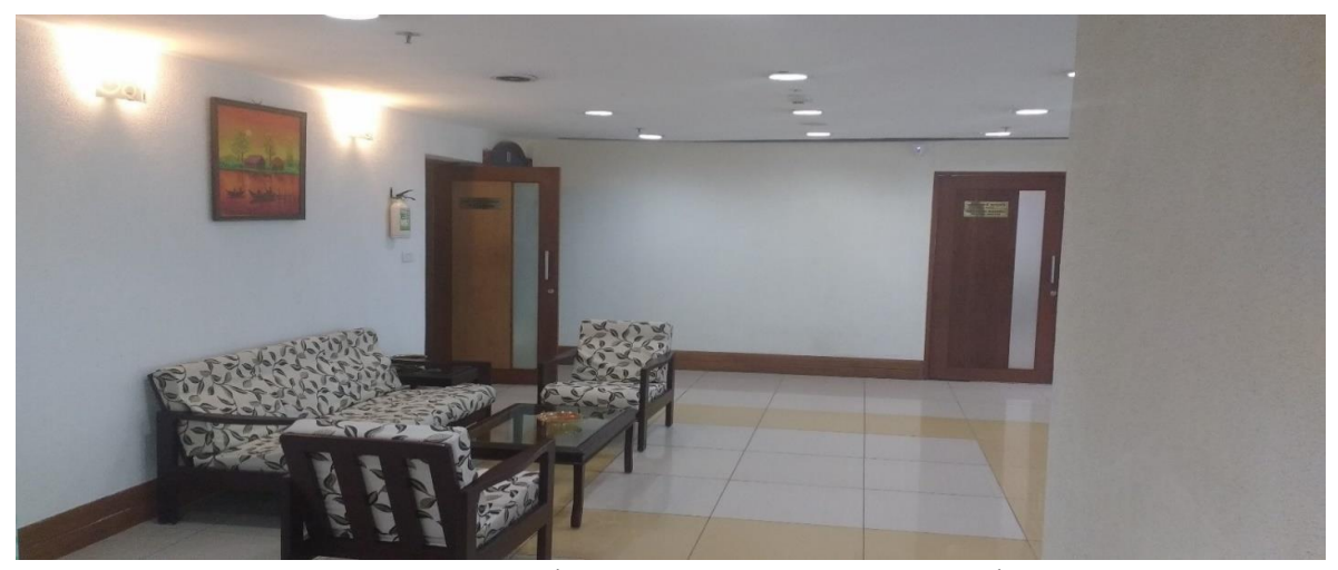
DG RTI's cabin, RTI office on the 5<sup>th</sup> Floor and some area on the 6<sup>th</sup> floor comprise RTI, Mumbai's office area.