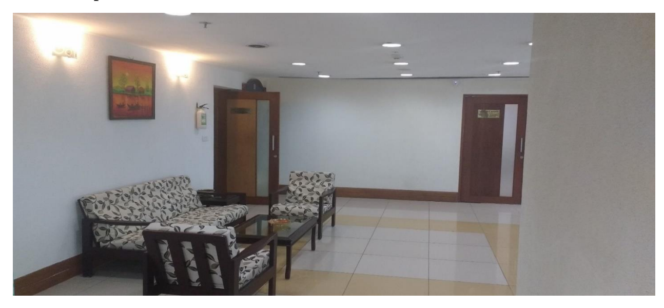
DG RTI's cabin, RTI office on the 5^{th} Floor and 2 faculty rooms on the 6^{th} floor comprise RTI, Mumbai's office area.