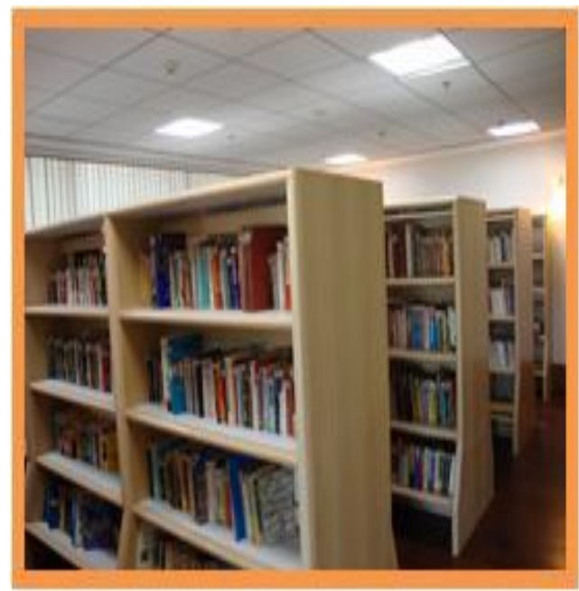
Library & Reading room

Other infrastructure in the RTI includes a Conference Hall (35 seating capacity) and an auditorium (154 seating capacity), equipped with LCD projector, motorized screen, Plasma screens, Video Recording Camera and stage lighting. All the above facilities are also equipped with wireless fidelity (Wi-Fi) ensuring round the clock wireless access to the web world of information.