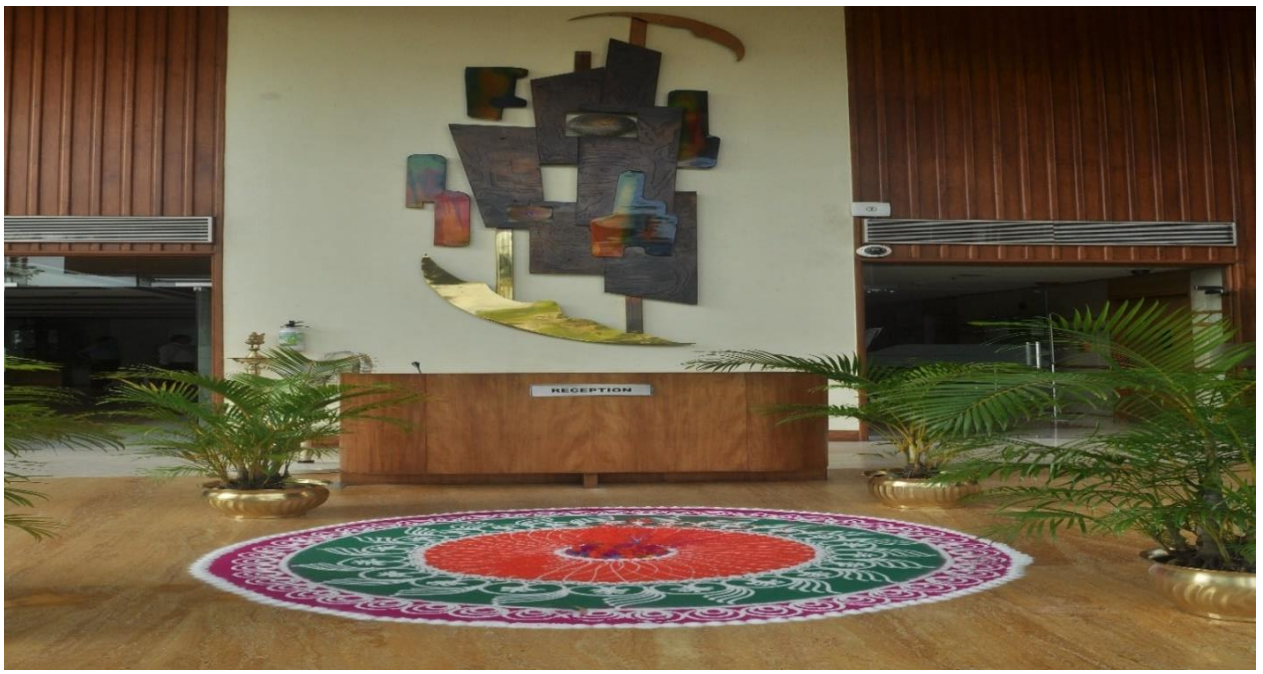
We have a reception area for convenience of trainees, visiting faculty, officers and guests.