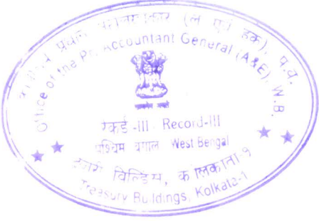
Sr. Accounts Officer (Record)

The tender notice is also available in the official website of this office i.e. https://cag.gov.in/ae/west-bengal/en (Contact Us > Working with us > Tender Notices).