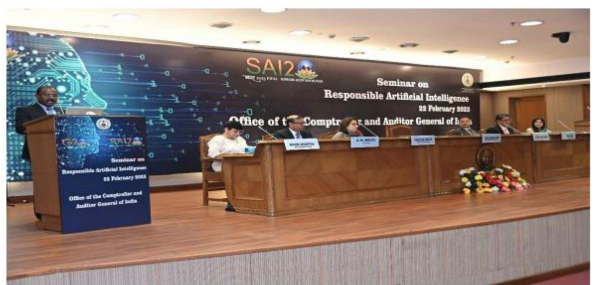
CAG of India addressing the officers at the SAI20 Engagement Group Seminar on "Responsible Artificial Intelligence"

Intelligence". The Workshop highlighted the role of Artificial intelligence in this era of express technological advancement, digital transformation and AI rapidly becoming the centre of attention for public sector enterprises.