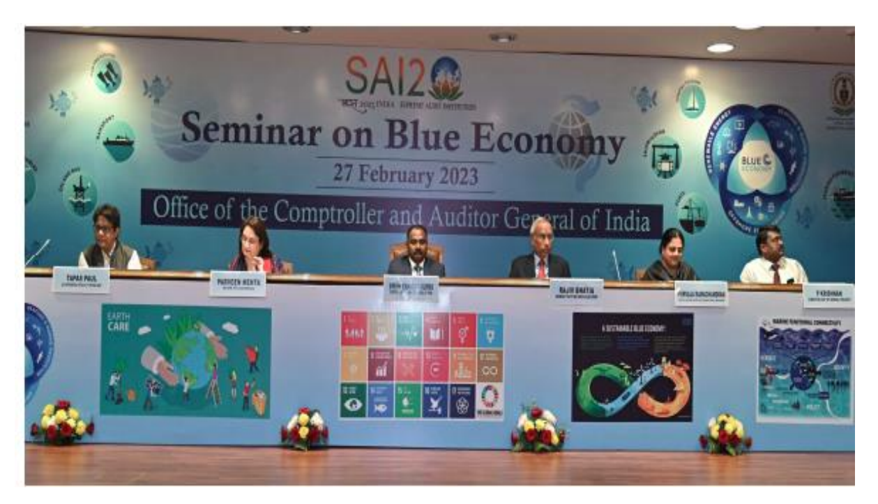
SAI20 Engagement Group Seminar on "Blue Economy" held at office of the CAG

and operational dimensions aimed at producing food and energy, supporting livelihoods, and driving economic advancement and welfare.