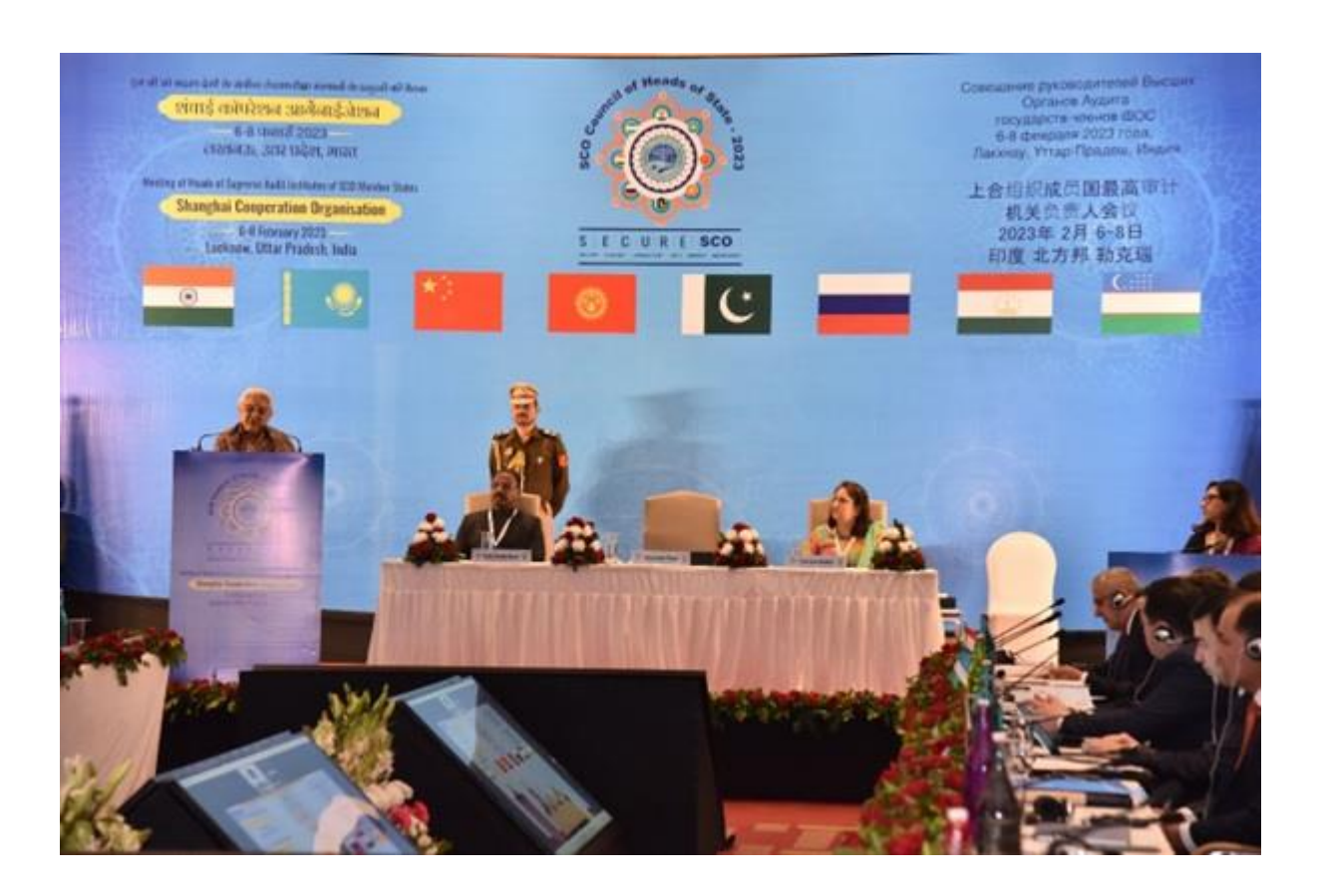
Hon'ble Governor of Uttar Pradesh, Smt. Anandiben Patel delivering inaugural address at the 6th Meeting of Heads of SAIs of SCO held in Lucknow, India (6 - 7 February 2023)