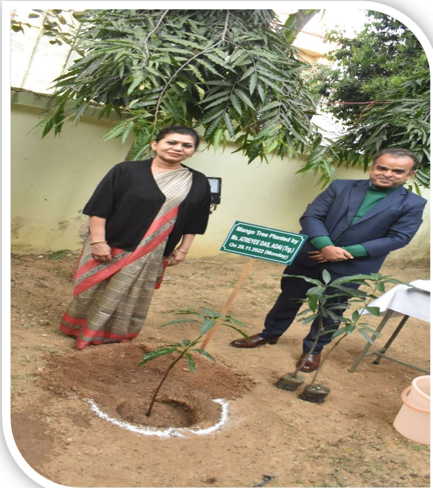
Plantation by ADAI