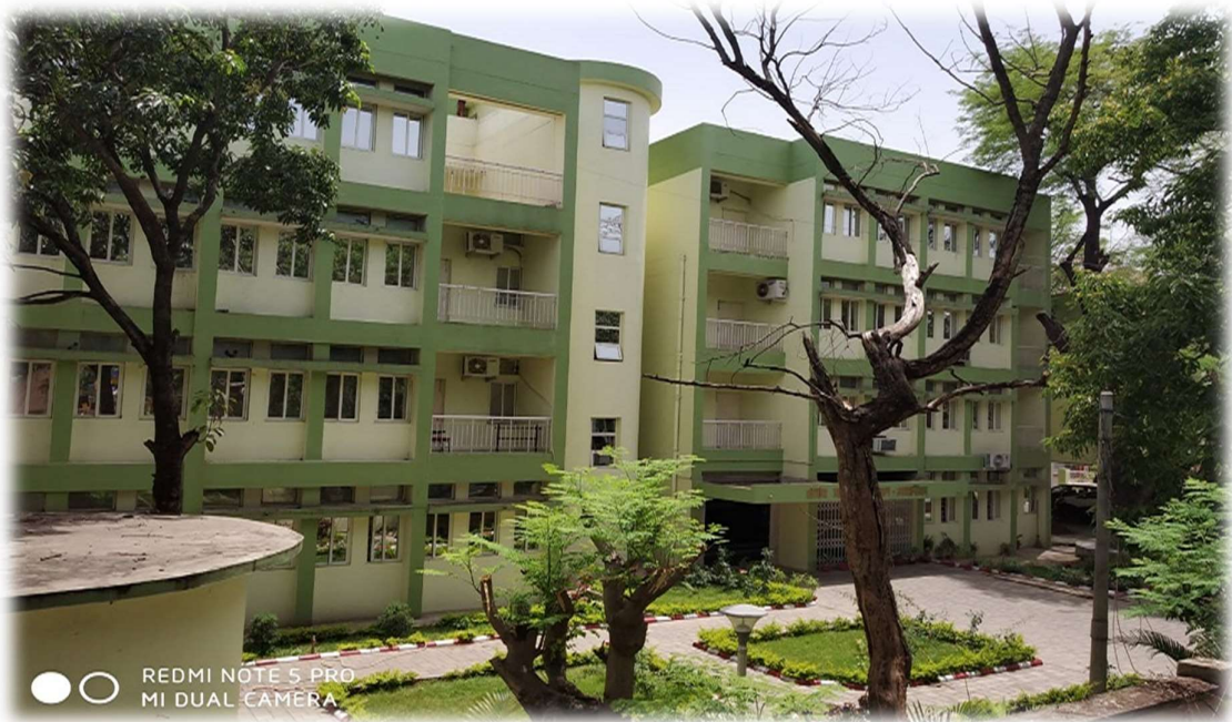
Hostel Building, RTI Ranchi