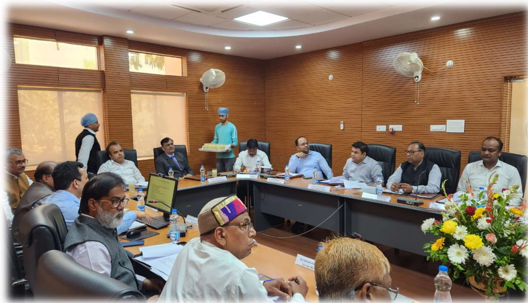
(ANNUAL MEETING OF REGIONAL ADVISORY COMMITTEE ON 24TH FEBRUARY 2023)