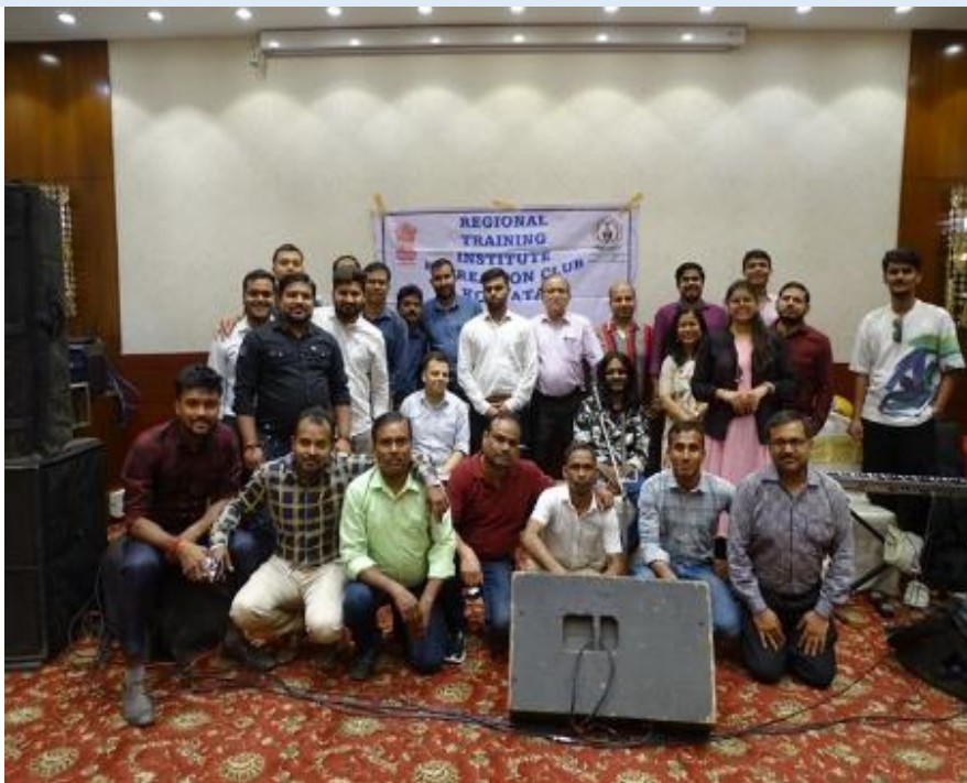
Club Members with the Musical Band during the cultural program.