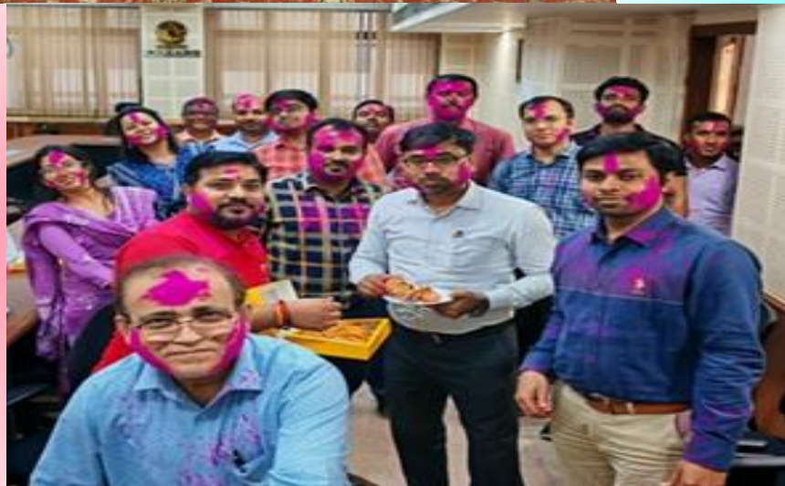
Club Members during Holi Milan Samaroh applied colors on each other, share sweets, and had a great time together.