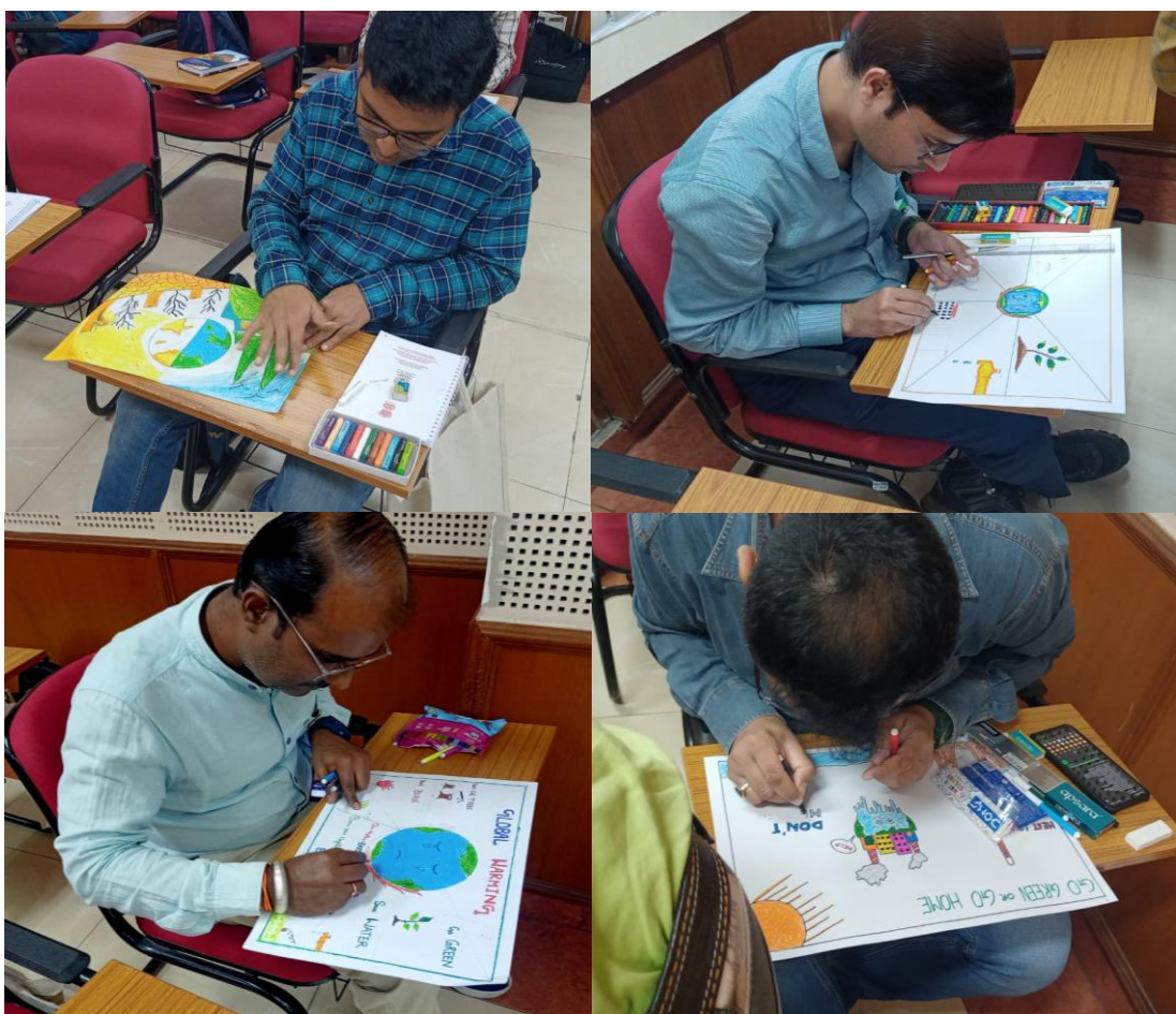
Participants of Orientation Training program participating in activities conducted during Training.