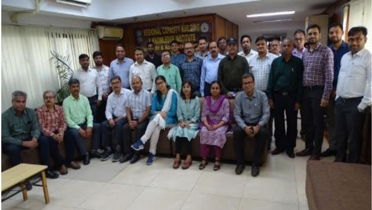
Participants of the All India Workshop on Compliance Audit, along with the core faculty members of RCB&KI, Kolkata