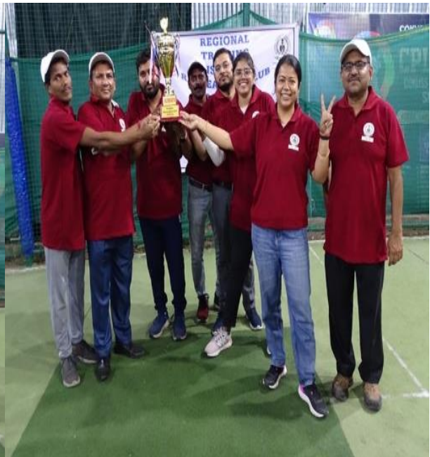
General Warriors – Winner Team (Left) and Admin Strikers – Runner up Team (Right)