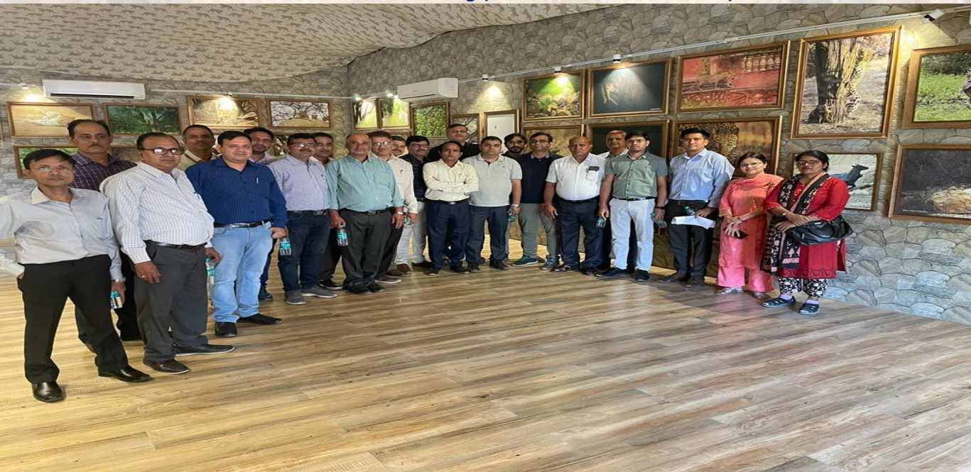
(In house workshop on "Prevention of Sexual Harassment at Workplace")

MCTP Level 3 training (31.10.2022 to 05.11.2022)