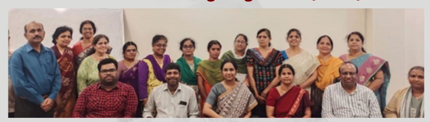
PDA RTC Bengaluru with MCTP Level 2 (Batch 4) Trainees