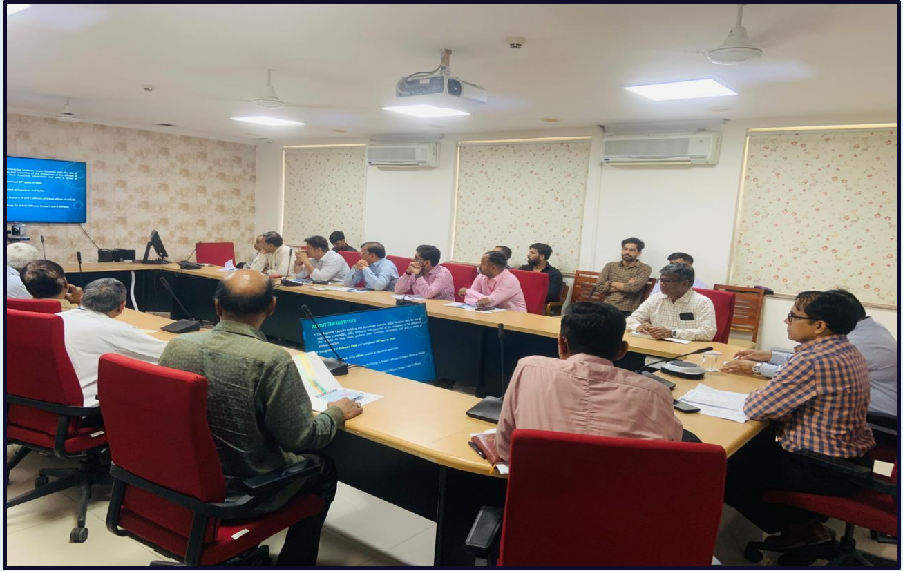
Session by Pr. Accountant General (Audit-1), West Bengal