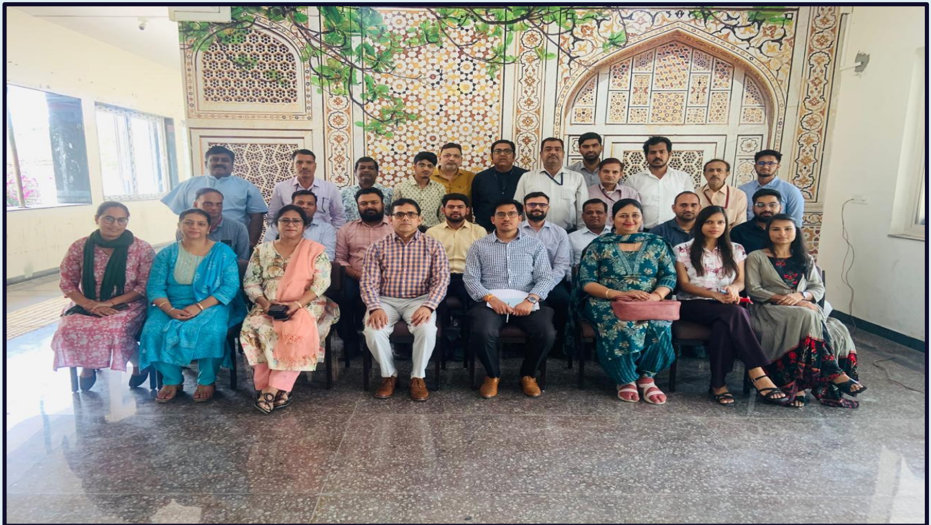
Training course on 'MS Office' from 22.04.2024 to 26.04.2024