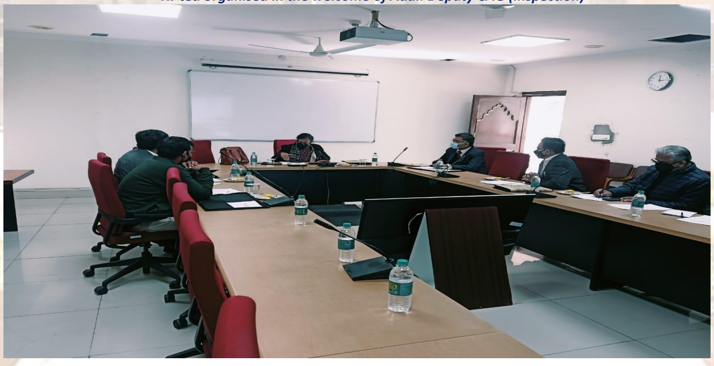
Discussion on the design of training module for capacity building of Inspection wing of CAG