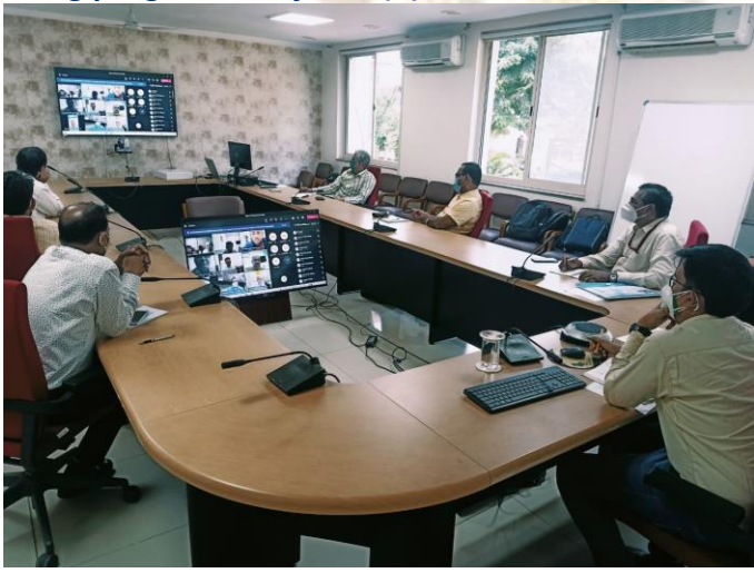
Onsite training organised for participants of offices located at Jaipur