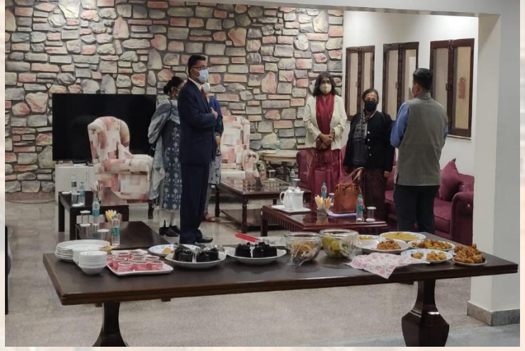
Hi-tea organised in the welcome of Addl. Deputy CAG (Inspection)