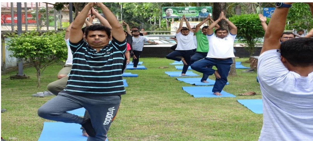
Yoga Day celebration on 21 June 2022 by Regional Training Institute/Kolkata

been celebrated on 21 st June 2022 by this office. As a part of the celebration, this office had organised a Yoga session on 21.06.2022 from 8.A.M to 10 A.M. It was organised in the vacant green land adjacent to 'Arunachal Bhavan', Salt Lake, Kolkata. Principal Director along with Officers/staff of this Institute had taken part in the Yoga session. Various Asanas were performed by the participants under the guidance of Yoga Instructor. It continued about 45 minutes and a light refreshment was arranged for all the participants after completion of the session.