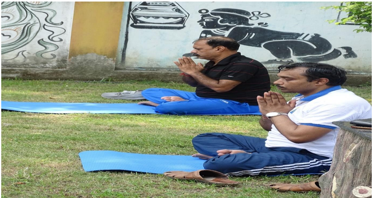
Yoga Day celebration on 21 June 2022 by Regional Training Institute/Kolkata