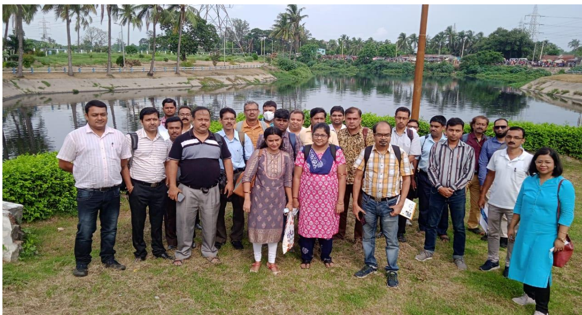
Field Trip to East Kolkata Wetland for the participants of Mid-Career Training Programme (Level 2)

A field trip to East Kolkata Wetland was organized on 22.06.2022 for the participants of Mid-Career Training Programme (Level 2) as a part of the training module. East Kolkata Wetland nurtures the world’s largest wastewater fed aqua culture system. The participants had a live observation of how the sewerage that is sent to the wetlands are subjected to solar purification in a natural way. This was followed by natural oxidation by which the water become favourable for the growth of algae and plankton on which the fishes feed upon. RTI, Kolkata acknowledges the co-operation extended by the Department of Environment, Government of West Bengal and West Bengal Forest Department for organisation of this field trip.