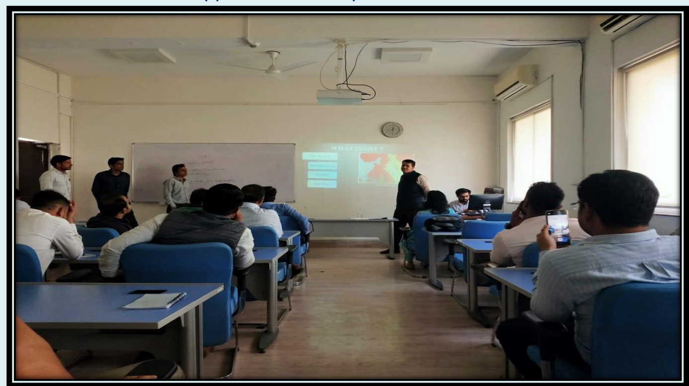
Group presentation on the topics allotted to DPAAOs