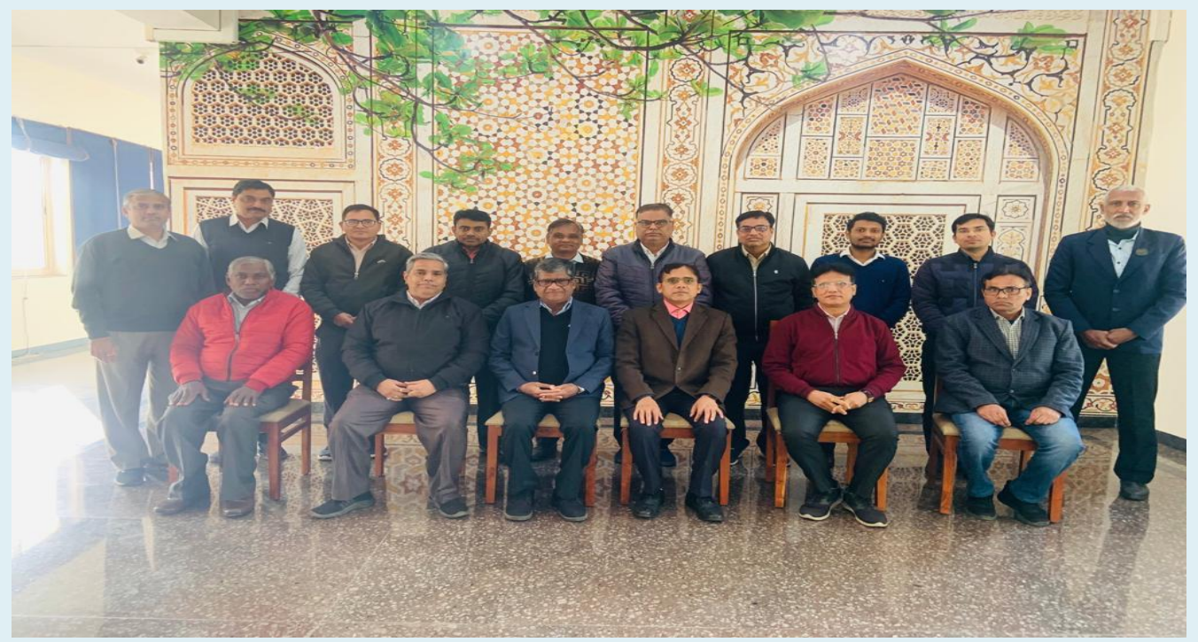
Glimpses of field visit of participants of MCTP Level 3