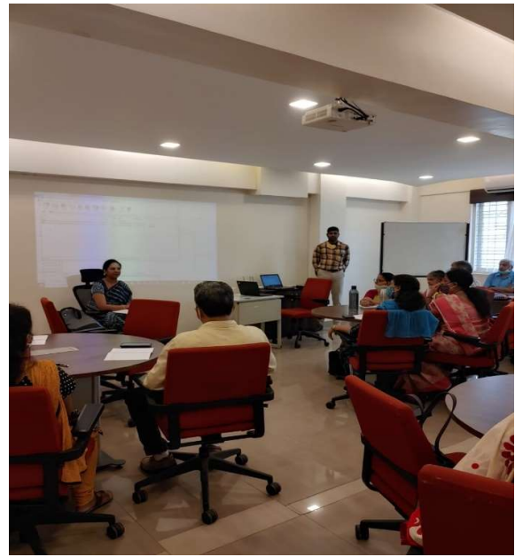
PD/RTC INAUGURATING COURSE