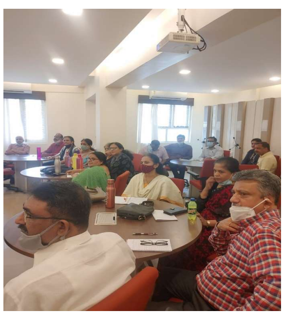
SESSION OF MCTP-LEVEL2 COURSE