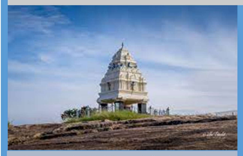
Kempegowda Watch Tower, Lalbagh, Bengaluru