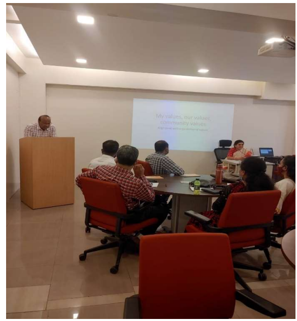
SESSION OF MCTP-LEVEL2 COURSE