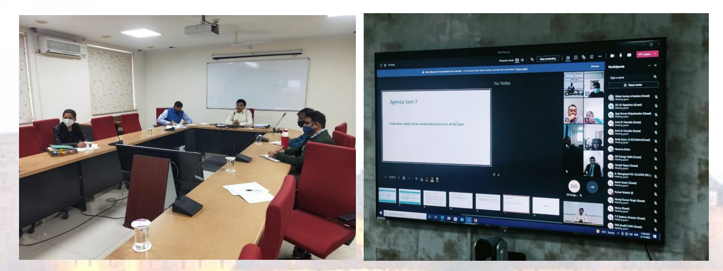
Regional Advisory Committee meeting (17 February 2022)