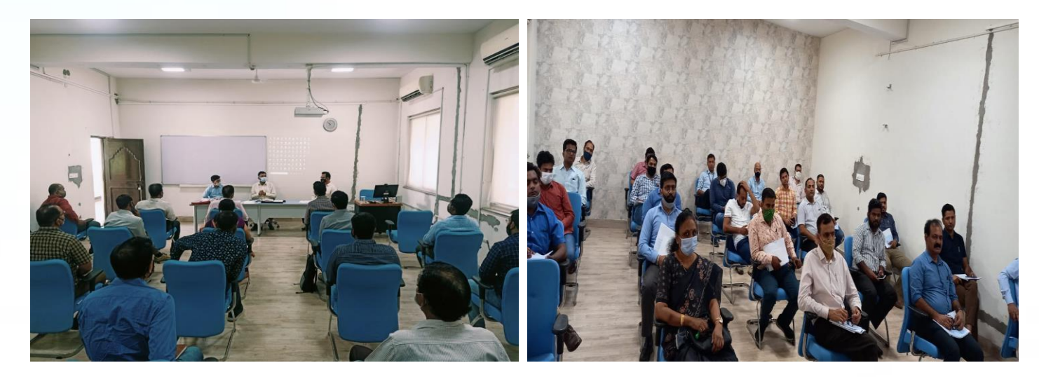
All India workshop on Draft paragraphs