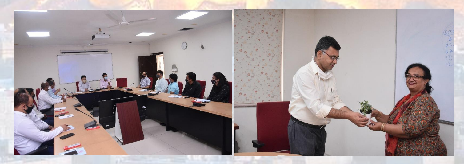
Director General & ADAI (Inspection) visting the RTI during valediction of the Special course for Inspection wing