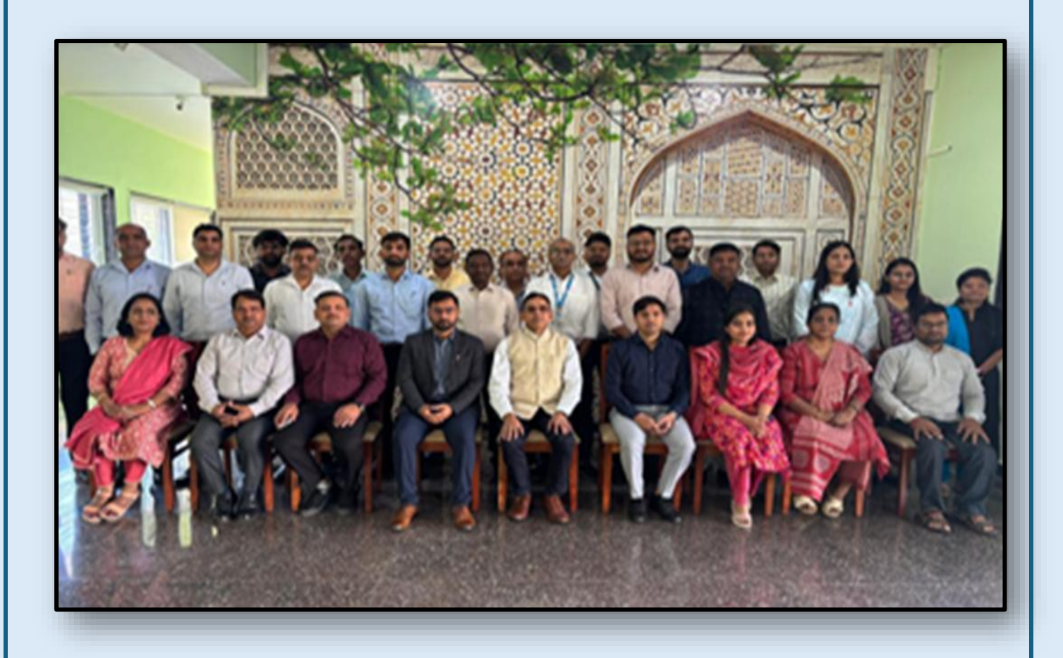
Glimpses of Panel Discussion in programs Audit of DBT Schemes and its effectiveness