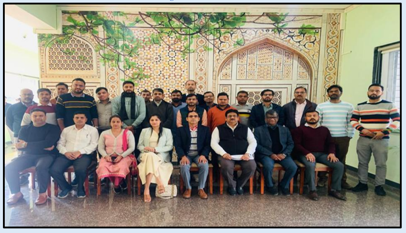
Audit in IT environment from 27.01.25 to 31.01.25