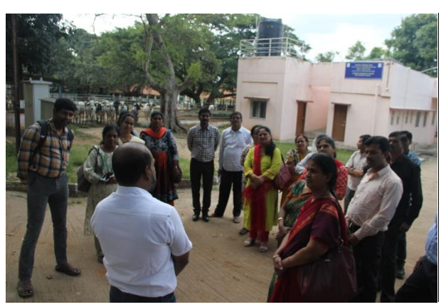
Cow shed at NDRI