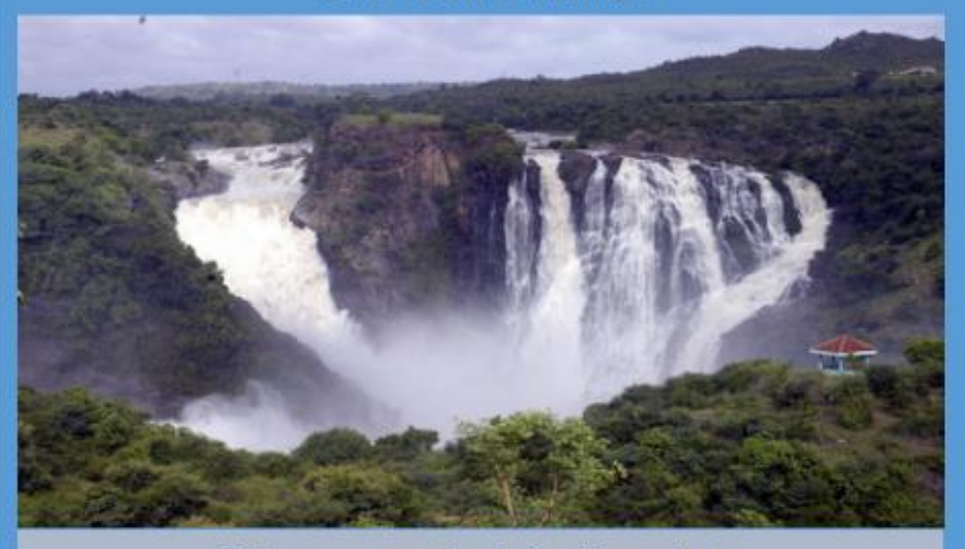
Shivanasamudra Falls, Karnataka