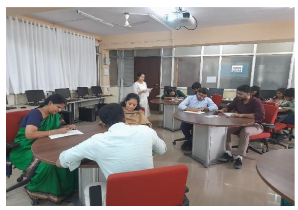
Hindi Shrut lekhan