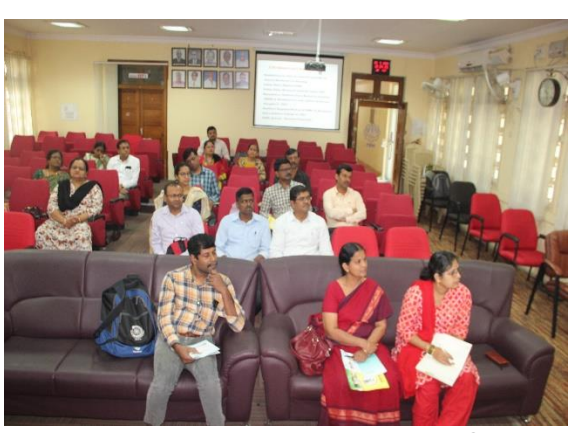
Sessions at NDRI, Blore