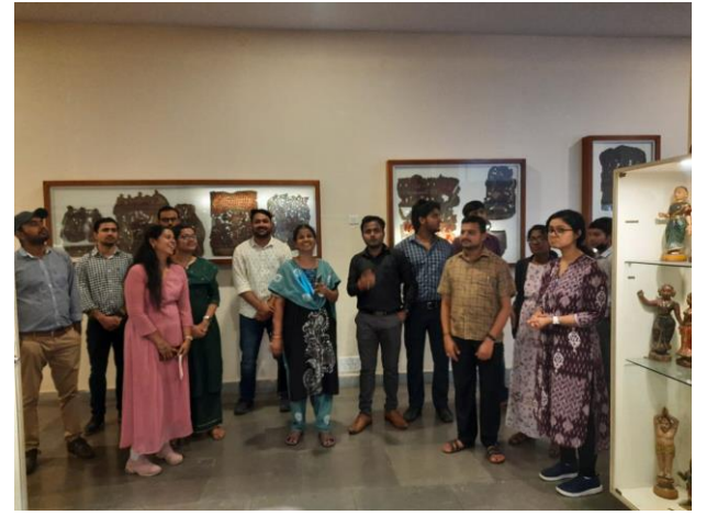
Art classes for DRAAOs-CGL 2018