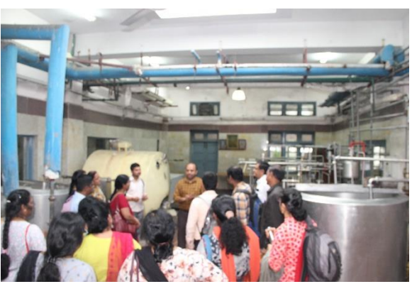
Processing Unit of NDRI, Blore