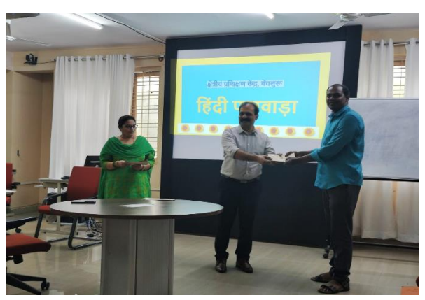
Prize Distribution-Valedictory event