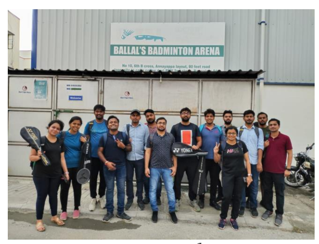
Sports Activity On 22nd August 2022 Ballals Badminton Arena