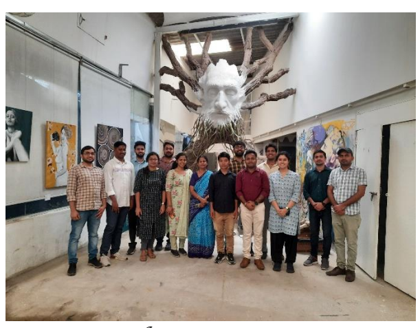
Bangalore Creative Circus On 06<sup>th</sup> September 2022