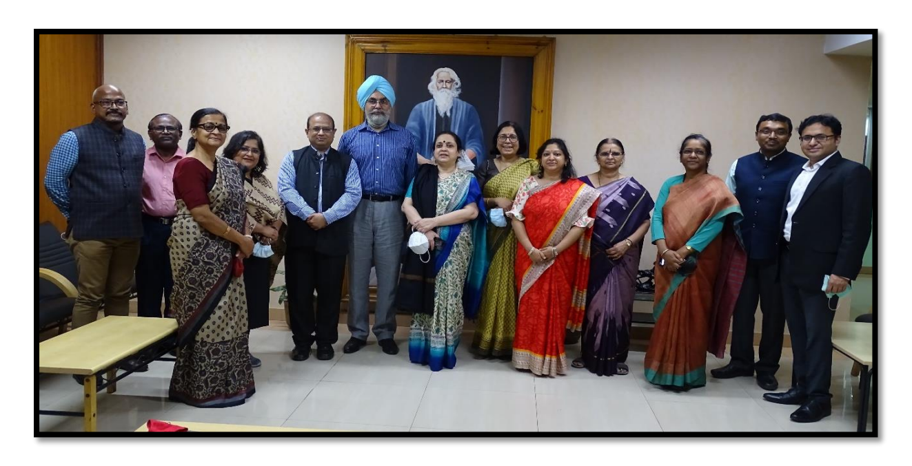
Group Photo RAC Members