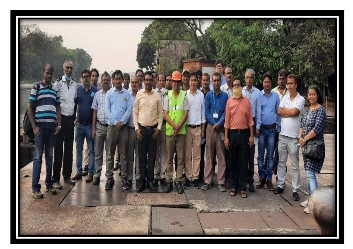
Group photo of field visit by participants