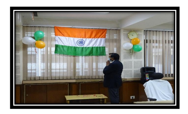
Republic Day Inauguration by Principal Director

At the end of the festival Principal Director conveyed thanks to all the Officers & Staff Members for their participation.