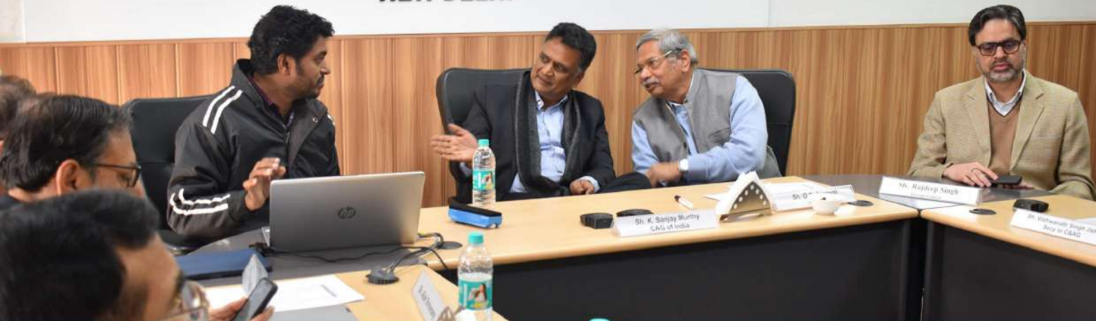
Shri K Sanjay Murthy, Comptroller and Auditor General of India, interacting with one of participant during presentation and discussion session.

During the valedictory session, Shri K Sanjay Murthy, Comptroller and Auditor General of India, graced the occasion and interacted with the participants, seeking their feedback on the workshop. In his concluding remarks, he emphasised the importance of effectively applying the knowledge and insights gained during the workshop to improve urban governance and enhance audit outcomes within their respective jurisdictions.