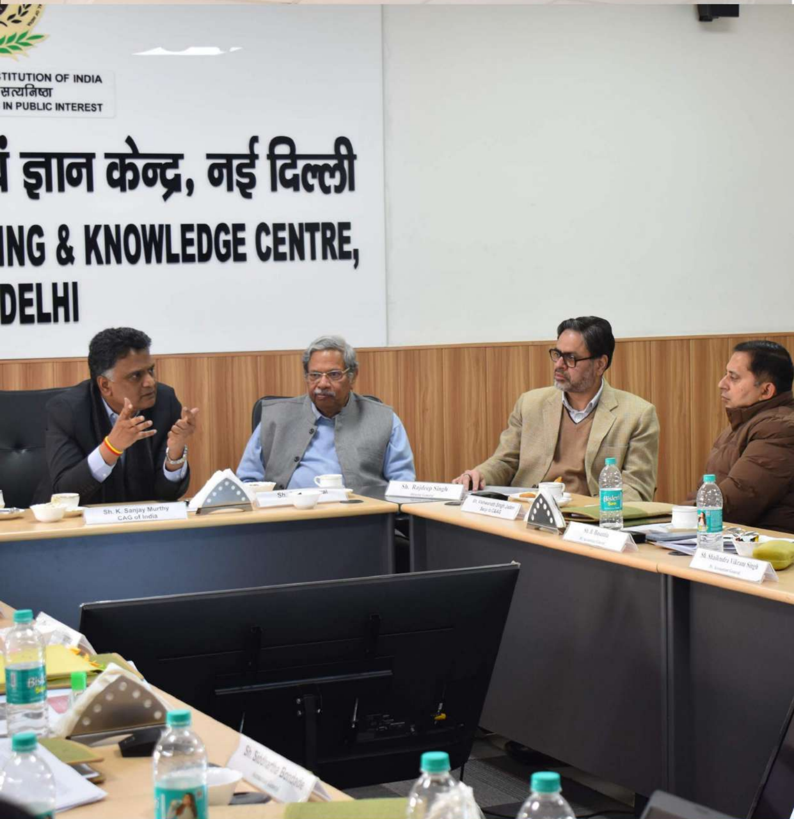
Shri K Sanjay Murthy, Comptroller & Auditor General of India visits RCB&KC, New Delhi