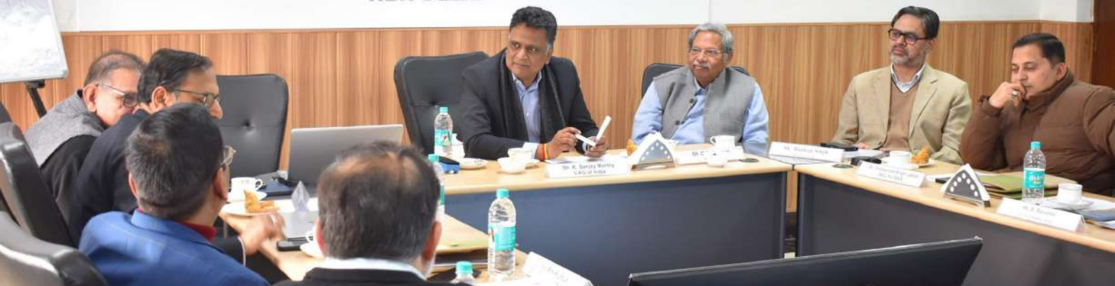
Shri K. Sanjay Murthy, Comptroller and Auditor General of India interacted with participants during the valedictory session of the workshop on "Urban Development and Governance"