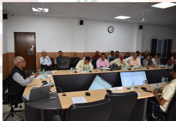
Photographs of the All-India Workshop conducted in hybrid mode on RTC Delhi's Knowledge Centre topic on the "Fundamentals of Public Debt Management and Expenditure Management".

SUPREME AUDIT INSTITUTION OF INDIA लोकहितार्थ सत्यनिष्ठा Dedicated to Truth in Public Interest