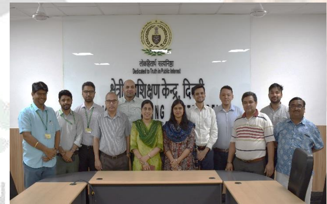
RTC Delhi Staff Members

लोकहितार्थ सत्यानष्टा Dedicated to Truth in Public Interest