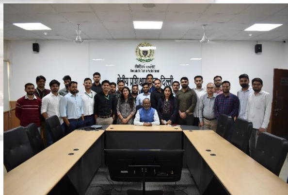
Photographs of the valediction session of the Induction training of the DRAAOs of CGLE 2018 batch addressed by Shri. Sushil Kumar Jaiswal, DGA(CR)