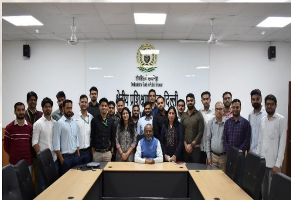
Induction Training for DRAAO 2018 Batch