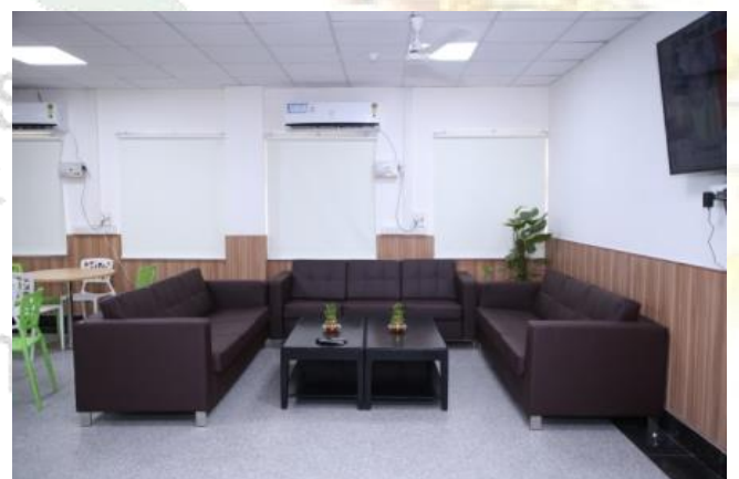
Photographs of State-of-the-Art Infrastructure in Regional Training Centre, Delhi