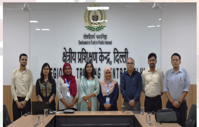
Participants from SAI Maldives attended Training in RCB&KC New Delhi with Director(RCB&KC) and other Staff member

During the first half of the 2023-24 (April 2023 to September 2023), three MCTP Level 2 programs and two MCTP Level 3 programs were conducted from April 2023 to September 2023 in which 133 participants (including two international participants from SAI Maldives) were imparted training.