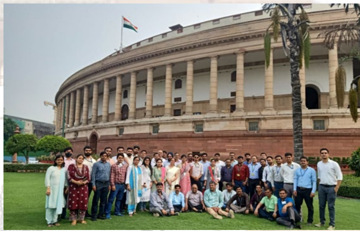
Field Trip organised during Mid-Career Training Programs (MCTP)-Level 2&3 to National Gallery of Modern Art (left) and President House (Right)