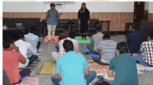
Yoga Sessions conducted during Induction Training for DRAAOs 2019 Batch

HQ office in June 2023 introduced new pattern of Part II of Phase I of the Induction Training for directly recruited Assistant Audit Officers. Based on the instruction, RCB&KC New Delhi conducted 35 working days training to all 29 DRAAOs CGLE 2019 Batch from Civil Audit offices from 26 th June 2023 to 14 th August 2023.