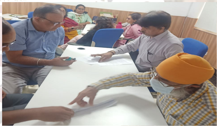
Participants performing Group Activities during MCTP Level-2 & 3 Training