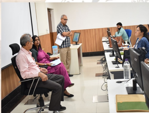
Inauguration of Training on “राजभाषा ऑनलाइन प्रबंधन प्रणाली” और “कंठस्थ संस्करण 2.0” by Director (RCB&KC)

As per the instructions of the HQ Office, two days special training on “राजभाषा ऑनलाइन प्रबंधन प्रणाली” और “कंठस्थ संस्करण 2.0” was conducted from 1st August 23 to 2nd August 23 in which 23 participants were imparted training from different field offices.