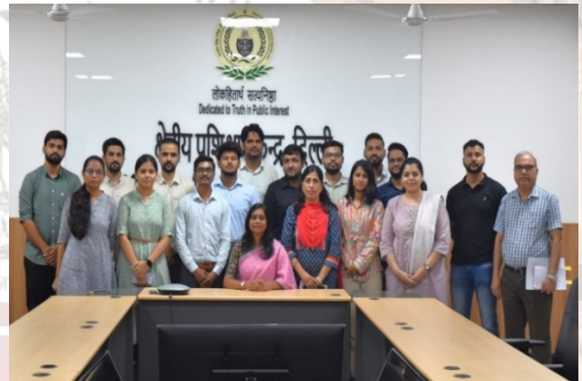
DRAAOs Batch 2021 Inauguration by Director (RCB&KC)

of the CGLE 2021 Batch was commenced from 25 th September 2023 and will continue up to 8 th November 2023. 17 AAOs from Defence Audit offices viz. DGA(DS), New Delhi, DGA (Air Force) and DGA (Navy) have been imparting training for the SAS exam scheduled to be held in the month of November 2023.