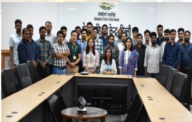
Participants of DRAAOs 2019 Batch with Director (RCB&KC)

As envisaged by the HQ Office, Part 1 of Phase-I of the Induction Training of the directly recruited Assistant Audit Officers of the CGLE 2019 Batch successfully completed in April 2023. 29 AAOs from Civil Audit offices viz. DGA (CE), New Delhi, DGA (CR), Pr.AG (Audit), Delhi, DGA (E&SD), New Delhi Pr.AG (I&CA), New Delhi, DGA (Energy), New Delhi and DGA (Infrastructure), New Delhi were imparted training. Part 1 of Phase-1 of the training mainly focused on giving the candidate an overview of the Subordinate Audit Service Examination scheduled to be held in the month of May 2023 and the syllabus of the SAS examination was covered during the course to enable the candidate to pass the SAS examination.