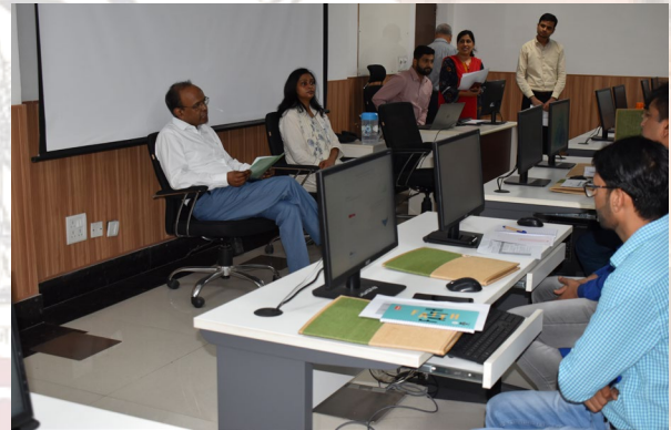
Inauguration of Refresher Course on "Audit in IT environment" by DGACR (Sitting left) and Director, RCB&KC (Sitting Right)

organising 2-day refresher courses on (i) Audit of Union Government Finance and Appropriation Accounts , and (ii) Audit in IT environment for the officers/officials already trained on above these topics. In these two courses 60 participants were imparted training.