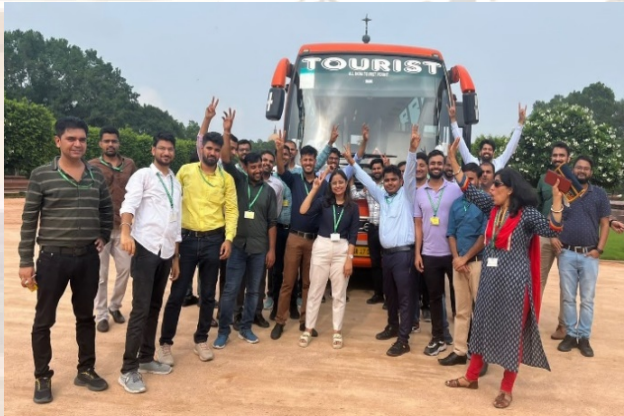
Field Trip organised during Induction Training for DRAOs 2019 Batch

organisations, developing their administrative & technical knowledge. Participants participated in cultural activities, yoga & meditation and sports activities. Besides this, participants made presentations on the topic given to them as a part of the soft skill training on presentation skill. During the training, participants taken to field trips also.