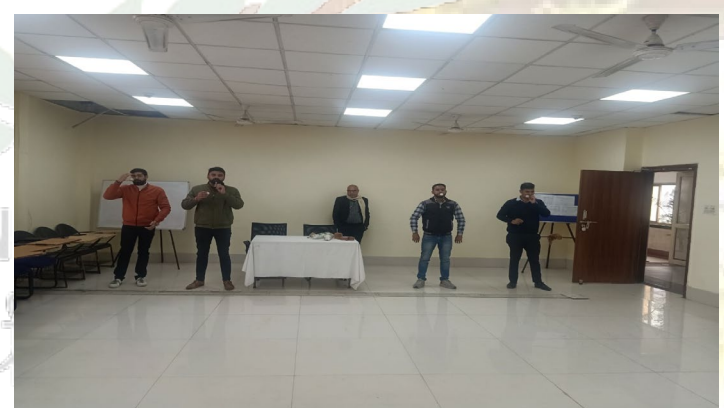
Participants Participated in Cultural Activities & Sports Activities during Induction Training for DRAAOs