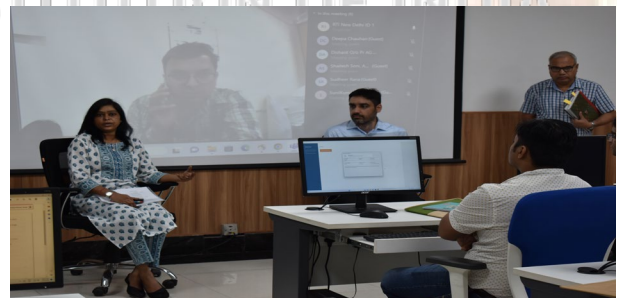
Inauguration of Training on " use of Dashboard/data for key personnel of both A&E and Audit Offices" by Director (RCB&KC)

As per the instructions of the HQ Office, three days special training on "use of Dashboard/data for key personnel of both A&E and Audit Offices" was conducted from 24 th July 2023 to 26 th July 2023 in which 26 participants were imparted training from different field offices.