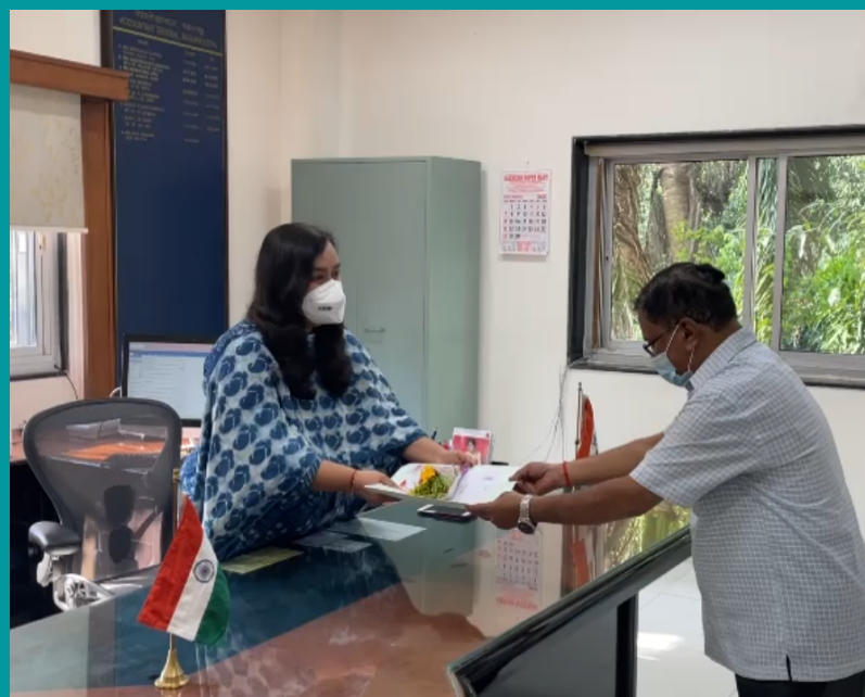
Pr. Accountant General handing over the 1st set of Digitally Signed e-PPO Authorities to the Pensioner