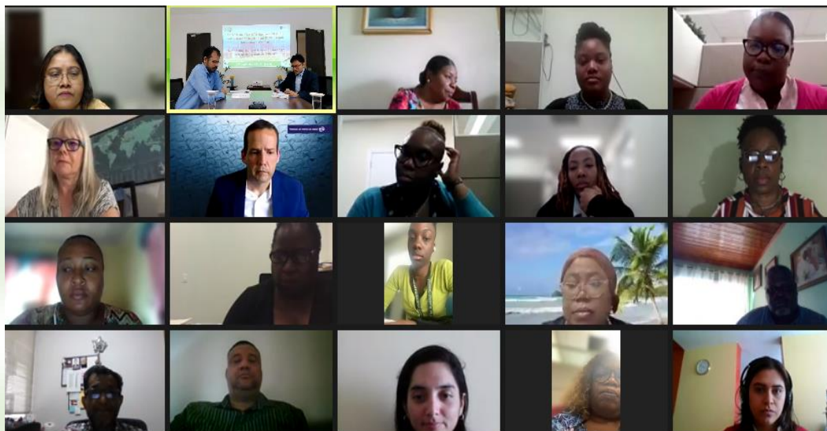
Participants during International Webinar on “Audit of Blue Economy, Issues and Challenges with special reference to SDG-14”, 26 th September 2023 (Batch-II)

During this webinar, resource persons from the National Institute of Ocean Technology (NIOT), Chennai; The Energy and Resources Institute (TERI) and other experts from SAI India; National Audit Office, Mauritius; The Audit Board of the Republic of Indonesia; The Court of Auditors of The Kingdom of Morocco; European Court of Auditors (ECA) and The Federal Court of Accounts of Brazil (TCU) shared their experiences related to Audit of Blue Economy, Issues and Challenges with special reference to SDG-14.