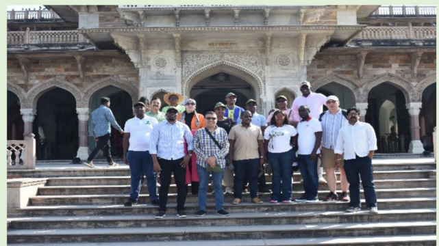
Participants at Albert Hall Museum

Albert Hall Museum , Jaipur, is one of Rajasthan’s oldest museums, built in 1887 during the reign of Maharaja Sawai Madho Singh II. It houses a rich collection of paintings, carpets, ivory artifacts, metal sculptures, crystal works, and an Egyptian mummy.