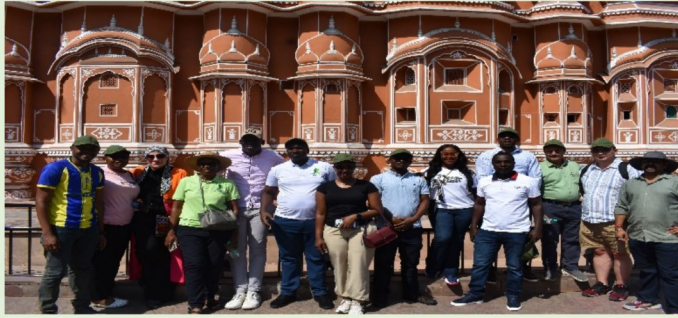
Participants at Hawa Mahal

The Hawa Mahal is an eco-tourism site and a five-storey building. It is the tallest building in the world that has been built without a foundation. It has a curved architecture that leans at an 87-degree angle, and a pyramidal shape which has helped it stay erect for centuries.