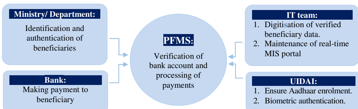
Chart 6.3.1: DBT Process (SOP)

The status in respect of the sampled schemes were as below: