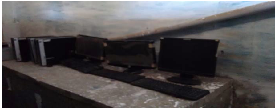
Hardware lying unutilised in Circle Jail, Datia 23-3-15

In the exit conference, ACS stated that the work was done by NIC and final adjustment would be made in co-ordination with NIC.