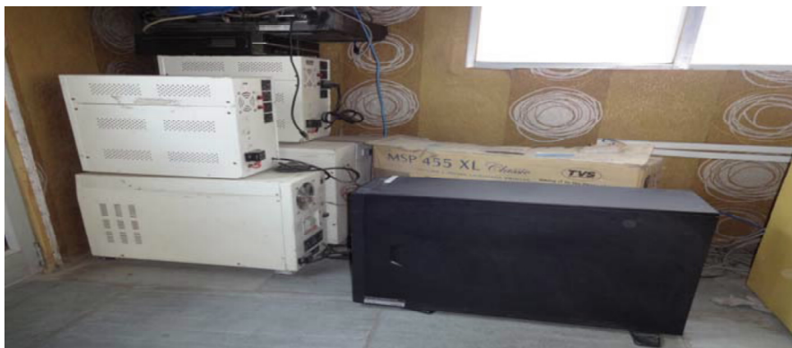
Hardware lying idle in Central Jail Indore 25-4-2015