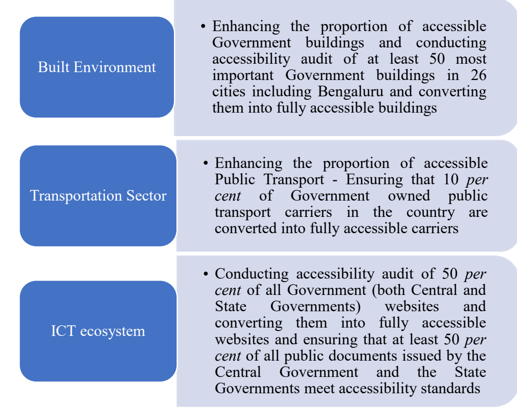
Chart 3.1: Verticals and their objectives