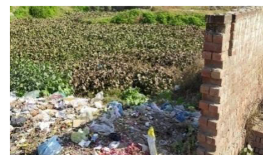
Pond at GP, Awan Khalsa (30.12.2021)

(vi) The work of construction of Retaining wall, digging and cleaning of pond located in GP Awan Khalsa, Block Mehatpur, District Jalandhar was sanctioned (October 2018) for ₹ 7.01 lakh. Against the approved cost, an amount of ₹ 3.44 lakh was incurred on the work and it was shown as complete in MIS. However, during physical verification, it was noticed that the work of retaining wall was