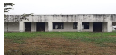
RGSK at GP Rupewal (05.01.2022)

The Department acknowledged the fact and stated (September 2022) that the efforts would be made to complete the works and instructions would be issued to field offices to utilise the buildings. However, compliance was awaited (November 2022).