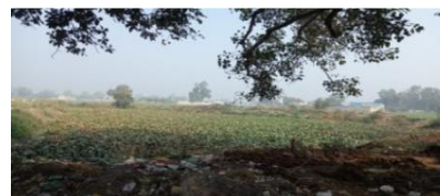
Pond at GP, Mansur Deva (21.12.2021)

(iii) Works of Renovation of community ponds in GPs Dhindsa and Mansur Deva Gram Panchayats of Block Ghall Khurd and Zira respectively were executed between May 2020 and January 2021. The works were completed after incurring an expenditure of ₹ 10.50 lakh 20 . During physical verification of the sites of works (November and December 2021), no renovation work of pond was found executed in the pond of Mansur Deva and it was covered with jungle jaala booti whereas work was found executed in May 2020 in the pond located in Dhindsa GP.