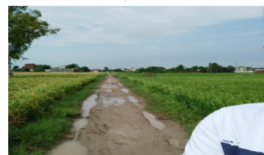
Street work at GP MiranKot Kalan (20.09.2021)