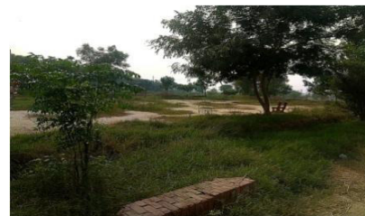
Pond at GP Ramuwala Harchoke (02.11.2021)

(C) The work of construction of park with various sports facilities at GP Ramuwala Harchoke, Block Moga-I was sanctioned (2017-18) for ₹ 13.00 lakh. It was observed that ₹ 10.37 lakh was incurred on execution of work during March 2018 to August 2019 and in MIS data the work was shown as complete.