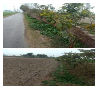
Incomplete Park at GP, Parjian Khurd (04.01.2022)

It was noticed that without obtaining the share of the GP, the work was started and expenditure of ₹ 0.97 lakh (₹ 0.25 lakh on labour and ₹ 0.72 lakh on material) was incurred during February to May 2018. Though, the MIS report indicated the work as completed but during physical verification (January 2022) of the park, it was noticed that the park was lying incomplete as only one side boundary wall was constructed. Thus, due to non-completion of park expenditure of ₹ 0.97 lakh remained unfruitful.