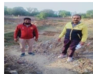
Pond at GP, Sukhanand (16.12.2021)

(i) Work of cleaning and digging of pond of 'Dere Wala' was executed during 2020-21 at Sukhanand Village - District Moga under MGNREGS. The work was completed after incurring an expenditure of ₹ 4.57 lakh. During physical verification of the site, it was observed that instead of using the pond for village wastewater, the villagers were using this pond for storage of cow/buffalo dung cake. Thus, incurring of expenditure for cleaning of pond was defeated.