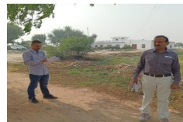
Pond at GP, Daudhar Garbi (10.11.2021)

During physical verification (November 2021) of the work, it was noticed that no inlet channel for water was found at site from where the water was to be collected in the pond. The water was not available in the pond and the villagers were dumping debris and other waste material in it. Thus, incurring of huge expenditure for renovation of pond was unjustified.