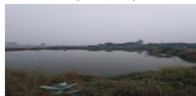
Pond at GP, Dhindsa (17.11.2021)