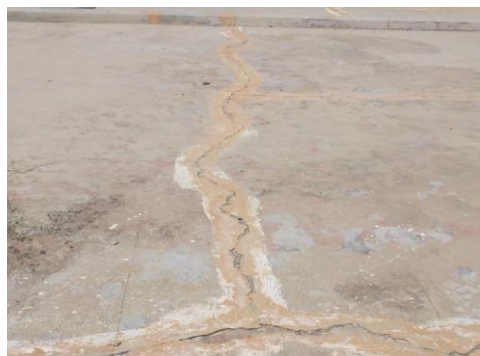
Leakage in roof in Museum building

The Government of Rajasthan (GoR) stated (October 2019) that there was no condition for providing University share in the sanction issued by ICAR. GoR also stated that the Museum had now been made operational.