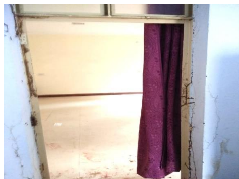
Termite hit door in Museum building