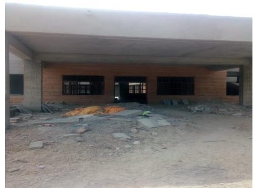
Pictures showing incomplete construction of Para Medical College at S.N. Medical College, Jodhpur (June 2019)