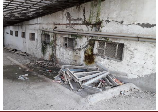
Water logging/seepage in basement of Research Hospital building

It was also noticed that GoR also did not release funds despite requests (June and September 2015) by RUHS. On the other hand, GoR demanded (September 2015) ₹ 5.00 crore from RUHS which was released earlier (March 2013) as interest free loan.