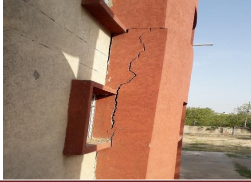
Cracks in walls of Research Hospital building