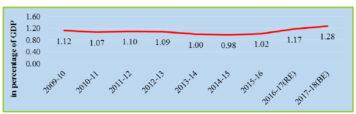
Graph 5.1: Trend in Public Expenditure on Health

The trend in public expenditure on health as percentage of GDP during 2009-18 is shown in Graph 5.1 :