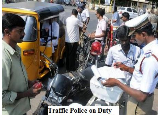
Traffic Police on Duty

Thus, the Traffic Department failed to implement the Perspective Plan 2011-16. Scrutiny of records of the Directorate of Traffic UP Police revealed that, against the total perspective plan of ₹ 535.56 crore department recovered fines of ₹ 125.48 crore (23 per cent), but GoUP sanctioned only ₹ 84.11 crore (16 per cent) for deposit into the fund during 2011-16. Against the sanctioned budget of ₹ 84.11 crore, only ₹ 69.59 crore (83 per cent) was spent by the department and ₹ 14.52 crore was surrendered. Audit observed that the amount of surrender was significantly higher in 2014-15 (89 per cent). It was also noticed that ₹ 10.82 crore were released by the Government only in the month of March 2015. Directorate informed to GoUP that, time available was not sufficient to complete the tender process for procurement of sanctioned traffic equipment in 2014-15.