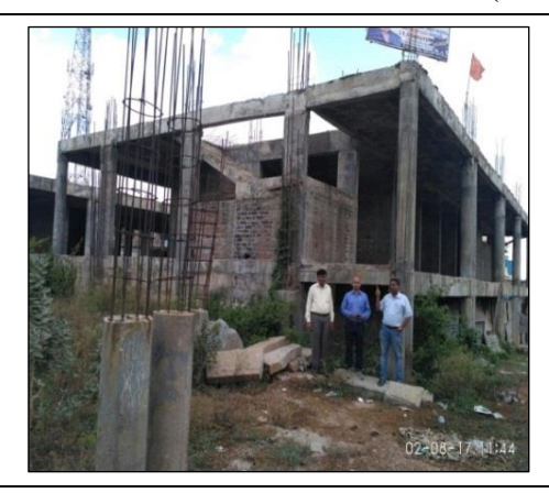
Exhibit 2: Incomplete commercial complex at Town Panchayat, Turuvekere (2.8.2017)

CO replied (September 2017) that 46 per cent of physical and financial progress had been achieved in construction of the building and the balance work had been estimated to cost ₹1.90 crore (as per Schedule of Rates of 2016-17). He further stated that the estimate was under approval and tenders would be invited soon after the estimate was approved. The joint physical verification conducted (August 2017) revealed that the work was executed up to the roof level of ground floor as shown below: