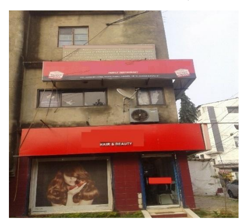
Figure 3.2: Encroachment in Kasba IEs by shops

WBSIDCL, it was noticed that in many premises, there were no sign boards at the gate or on the wall indicating name of the entrepreneurs, plot no, etc., to identify the current occupant. Also 15 plots were used for residential purposes at Durgapur Rehabilitation Industrial Park (RIP). Further, scrutiny showed security services