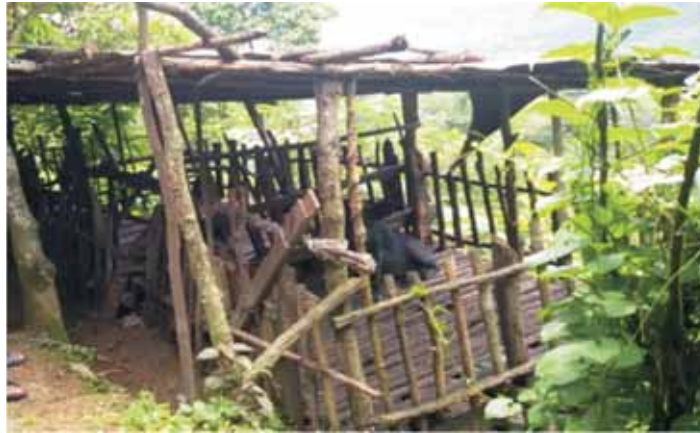
Photograph showing dilapidated pigsty constructed out of first instalment

Also, in land based trades, the forest cleared for plantation out of first instalment was rendered unfit for plantation as there was overgrowth by the time the second instalment was released. Random/delay in the release of cash assistance defeated the purpose of assistance.