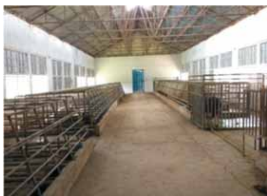
Dry and Pregnant Pen

During the joint physical verification (August 2016) of Pig Farm Thenzawl, it was noticed that the farm had three pens with only 19 sows against the required capacity of 100 sows. It was stated that outbreak of Porcine Reproductive & Respiratory Syndrome (PRRS) virus had an impact on production and supply of piglets to the NLUP beneficiaries.