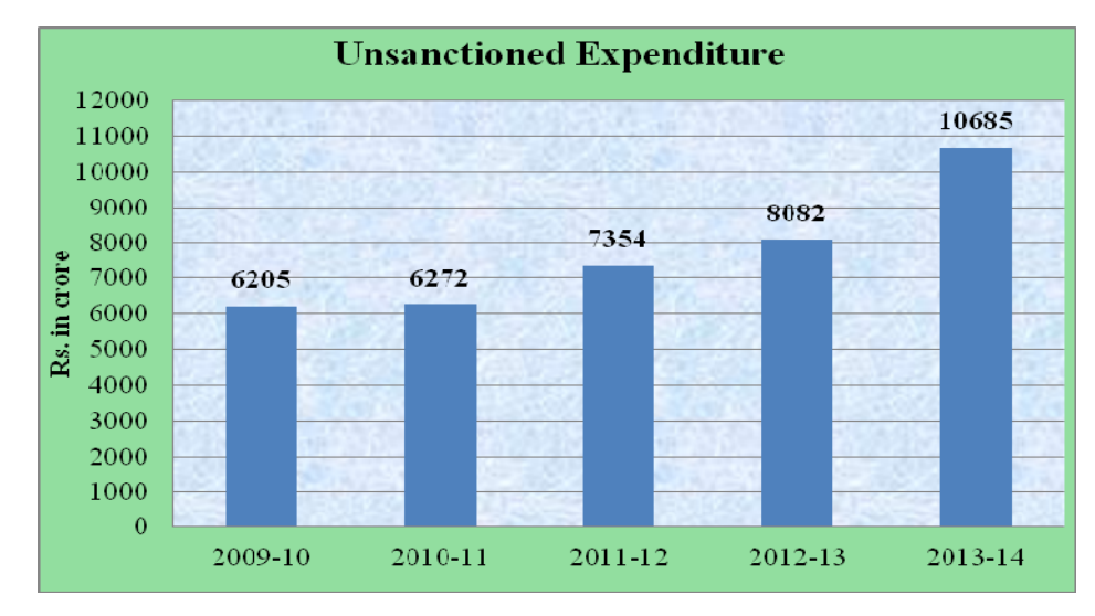
Diagram-2.3 Unsanctioned Expenditure

All items of irregular expenditure incurred by IR, such as expenditure incurred in excess of sanctioned estimates, expenditure incurred without detailed estimates and miscellaneous overpayments etc. are noted in objection books by the zonal railways administration and treated as unsanctioned expenditure.