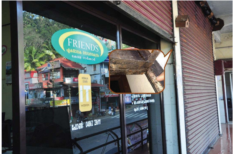
Picture depicts view of Idukki Centre, where the steel shutter cannot be closed. The shutter channel is blocked with wooden logs to prevent collapsing of the damaged steel shutter. Inset picture displays a wooden log used as blockade.