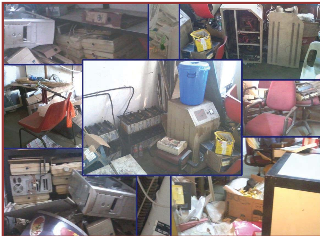
Picture shows dumping of scrap over the UPS, battery and near the counters in Thiruvananthapuram and Malappuram Centres.

The Government stated (November 2014) that the scrap had since been disposed of from Centres in Thiruvananthapuram, Kollam, Pathanamthitta, Malappuram, Kannur and Kottayam and instructions had been issued to other Centres for disposal.