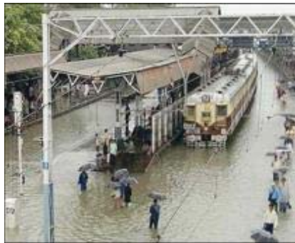
Mahim Railway Station

Greater Mumbai area received unprecedented rains in July 2005 which flooded many parts of Mumbai city and suburbs. The rail and road traffic came to halt as shown in the photographs below.