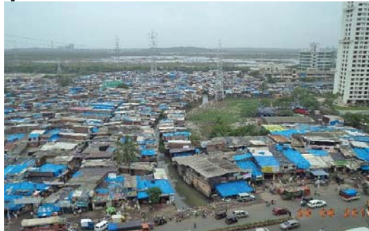
Encroached Shastri Nagar Nalla, Goregaon (W)

The cost of Phase-I work for Rehabilitation of hutment dwellers by training, construction and widening of Shastri Nagar nalla system from Link Road to Creek in catchment area No. 216 in P-South Ward of Goregaon (West) as per the DPR was ₹ 3.47 crore. The scope of the work included widening (15 meters), deepening (3.5 to 4.5 meters) and construction of 840 meters of retaining walls (420 meters on either side) of Shashtri Nagar nalla. The work was awarded (March 2007) to M/s Raj Engineers at a cost of ₹ 6.52 crore to be completed by March 2008.