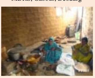
MDRS, Gabbur, Deodurg