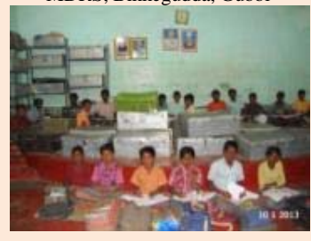
MDRS, Bikkegudda, Gubbi

MDRS at Baby Betta, Belamagi, Bikkegudda, Chadchan, Gabbur, Huliyurdurga, Indi, Kurudihalli, Mukthimath, Natekal, Sindhigere, Sakarapatna, Shikaripura and Shiralakoppa where there were no separate classrooms, dormitories or dining halls. During day time, the available space was used for conducting classes while it served as a dormitory during the night.