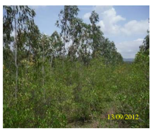
Plantation at Varavi