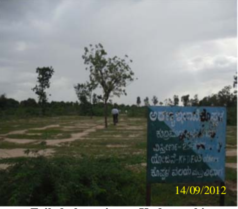
Failed plantation at Kudremothi