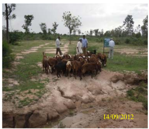
Grazing at Kuduremothi plantation at the time of inspection

Physical verification (September 2012) of plantations raised at Kuduremothi in Koppal range during 2008-09 revealed that in 25 ha of land with various species like Honge, Neelagiri, Karijali was partially destroyed due to grazing by livestock and failed plantations as shown in the photographs: