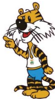
The official Games mascot "Shera"

India, surpassing the IX Asian Games (held in Delhi in November- December 1982) and the I Asian Games (held in Delhi in March 1951).