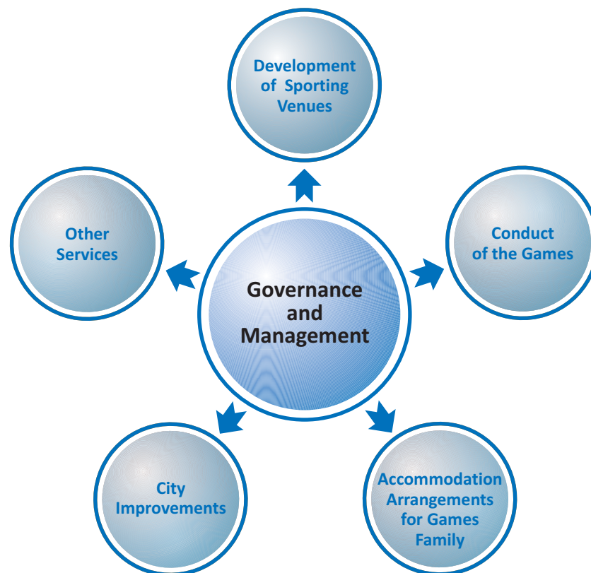
Figure 1.1 - Organisation of CWG 2010

The organisation of the Games (and, indeed, any other multi-sport international events) constitutes a complex, long-gestation, multi-dimensional project with numerous participants/ activities.