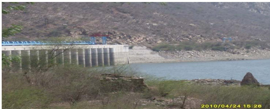
Water level of Bisalpur Dam stands at 302.820 metre (24.4.2010).

Audit observed that as per the Isarda Report 10 (August 2001), the capacity of irrigation reservoirs in the catchment of Bisalpur Dam was 1,545 Mcum. The capacity increased to 2,676.42 Mcum (73 per cent) as per the survey report of State Water Resources (Planning) Department on the Bisalpur catchment area (May 2010), due to existence of 27,513 dams/anicuts/local ponds/quarries, 11 which reduced the inflow of water into the Dam. As a consequence, the dependability yield of the dam has reduced to 40 per cent against stipulated 75 per cent. This indicated that no realistic technical survey of the surrounding catchment area was conducted by PHED and the Bisalpur Dam could not be a reliable and regular source of water to cater to the increasing needs of Jaipur City.