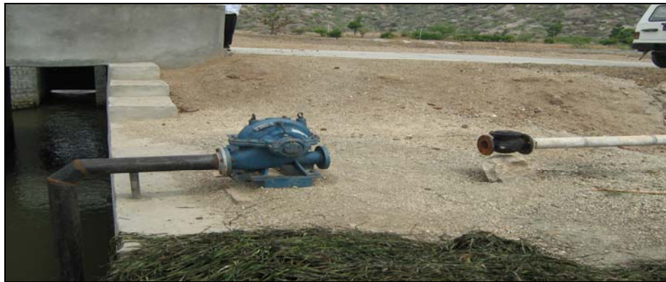
Photograph showing non-connection of rising main of water supply scheme with source (06.07.2010)

Audit scrutiny of the records of Executive Engineer (EE), PHED Division, Sirohi revealed (July 2009) that in pursuance to the GoI instructions, the CE requested (September 2004 and February 2005) the Chairman, Water Reservation Committee (Divisional Commissioner, Jodhpur) to reserve water in Jawai Dam for the re-organisation project as per the demand for water 15 and to convey consent of allowing Jawai Dam as the source of the re-organisation project at Sheoganj. Though the CE did not get the requisite consent, the re-organisation project was taken up in April 2005, without intimating the GoI regarding the status of water reservation. The re-organisation project was lying incomplete as of August 2010, after spending ₹ 2.20 crore (between November 2005 and December 2008), as the intake sluice to connect rising main 16 with the proposed source of water (Jawai canal) was not constructed.