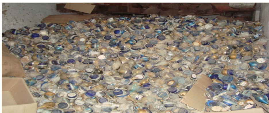
Defective water meters dumped in the workshop for want of repair

• Number of non-functional metered connections has increased from 1.01 lakh in 2007 to 1.39 lakh in 2010. SE stated (June 2010) that due to shortage of staff and non-availability of new meters, functional meters could not be installed. There were also 33,204 defective water meters dumped in the workshop since 2007 for want of repair.