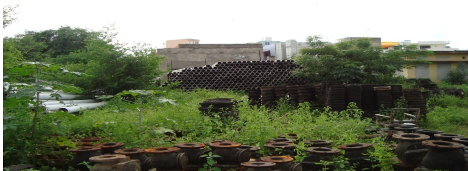
Overstocking of pipes

The State Government stated (November 2010) that to execute the schemes and to maintain the water supply, sufficient material in stock was needed, which was not possible with the existing reserve stock limit of ₹ 25 lakh. The fact is that without getting the reserve stock limit increased, the Government kept excess stock in the stores valuing more than ₹ 1 crore for 36 months from April 2007 in North Wing and for 33 months from July 2007 in South Wing, violating the Rules. Besides, non-utilisation of stocks has the potential of denying funds availability to other schemes.