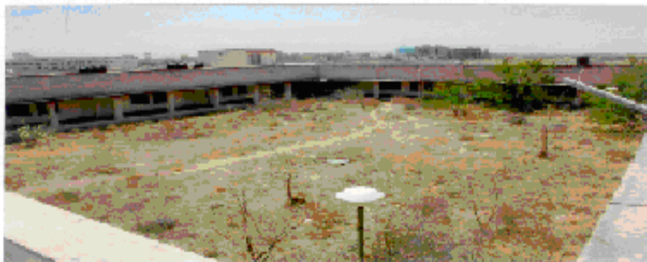
Unutilised Boys Hostel Building (PG) at Medical College, Kota

Thus, investment of ₹ 1.32 crore on construction of the hostel building remained idle since May 2008.