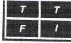
TABLE TENNIS FEDERATION OF INDIA